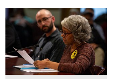
Portland's Proposed Rental Screening Rules: