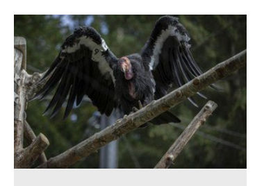
New Plan Would Return California Condors To