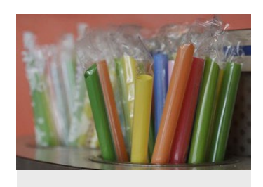
Plastic Straw Regulations Move Forward — With A