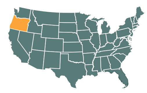
In 2018, Oregon had the highest rate of homelessness among families with children.

• $130M: Increasing the supply of affordable housing by bolstering the Local Innovation and Fast Track (LIFT) Housing Program to build 1,700-2,100 units of affordable owner and rental housing with private and nonprofit housing developers.