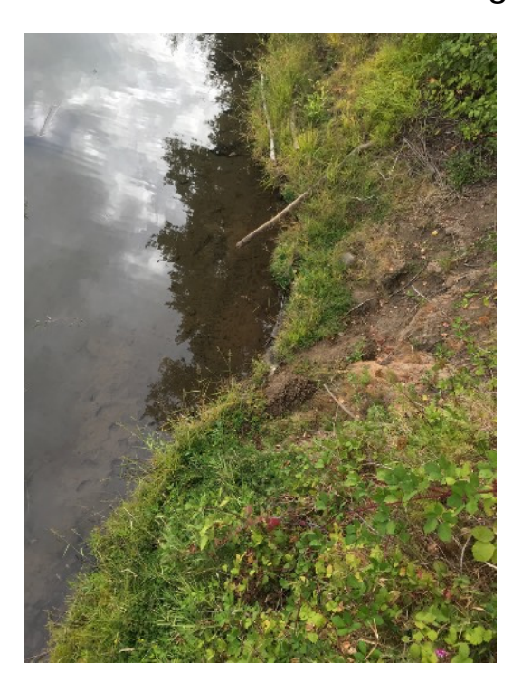
September 7, 2018

The water level did not change during this 2 month period