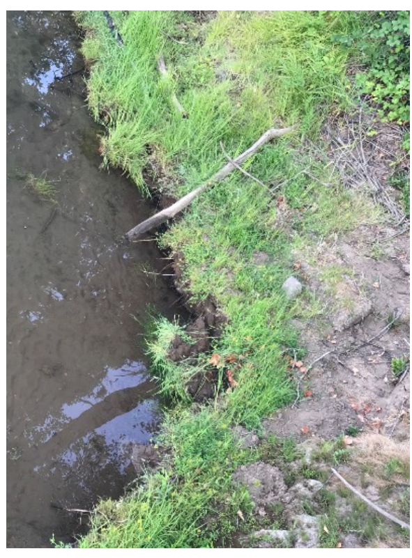
August 6, 2018