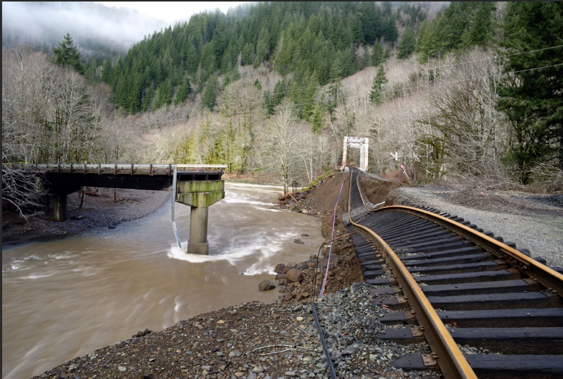
Figure 2: Damage to the Port of Tillamook Bay railroad from channel migration of the Salmonberry River