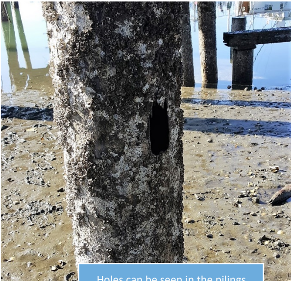
beneath Port Dock 5

The Port of Newport asks for your backing and advocacy as we seek grants for this vital project, and we hope that we can count on you for a letter of support that will help us secure funding.