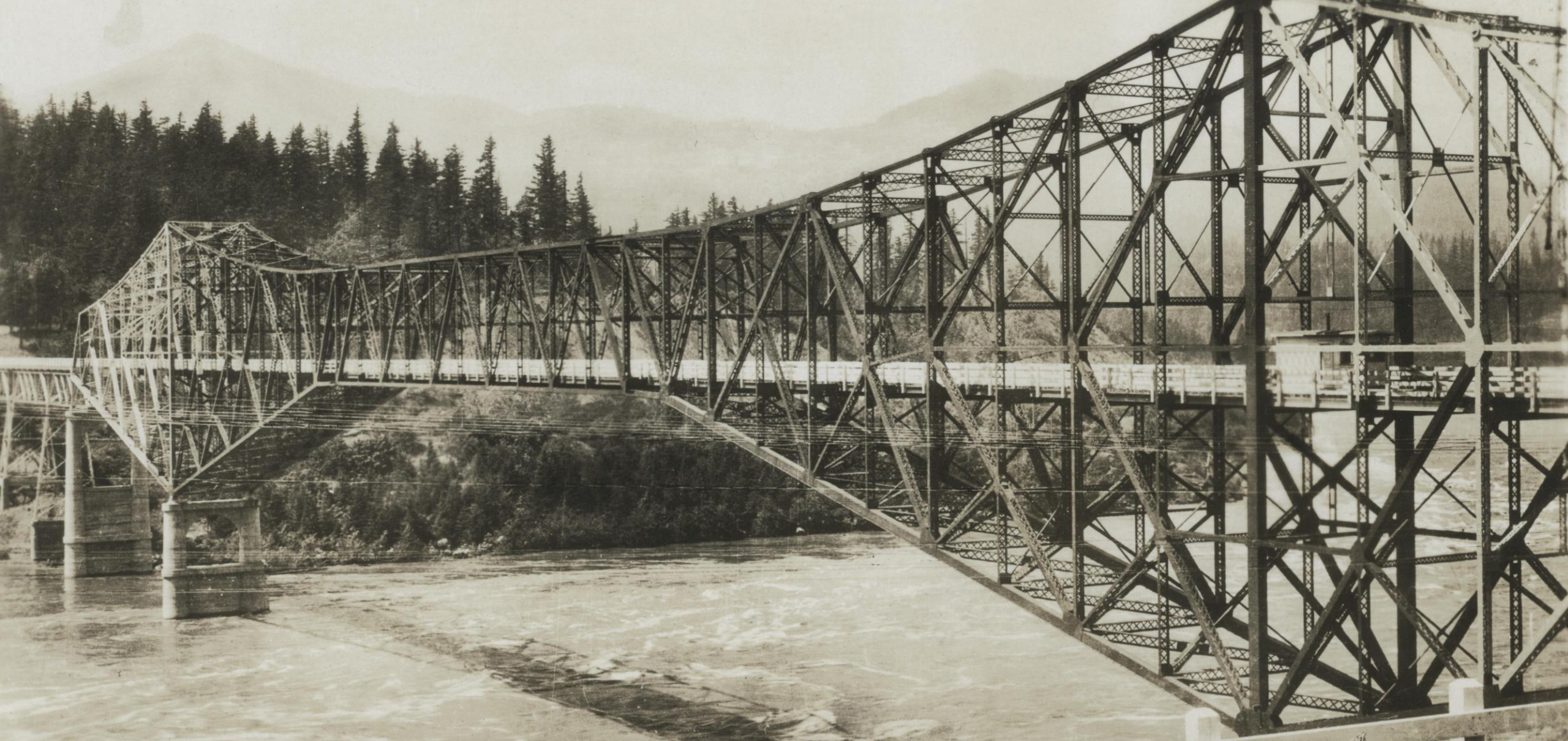
Bridge Of The Gods, north abutment of legendary bridge in distance. Columbia River Highway, Oregon.