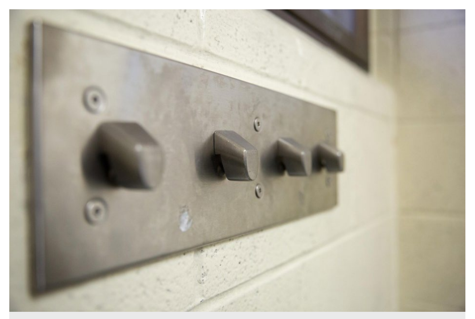
A ball-bearing hook system in a Clark County Jail cell in Vancouver, Washington, on March 14, 2019. The bearings allow inmates to hang light personal items but does not allow a cord or rope to be affixed to the bearings.