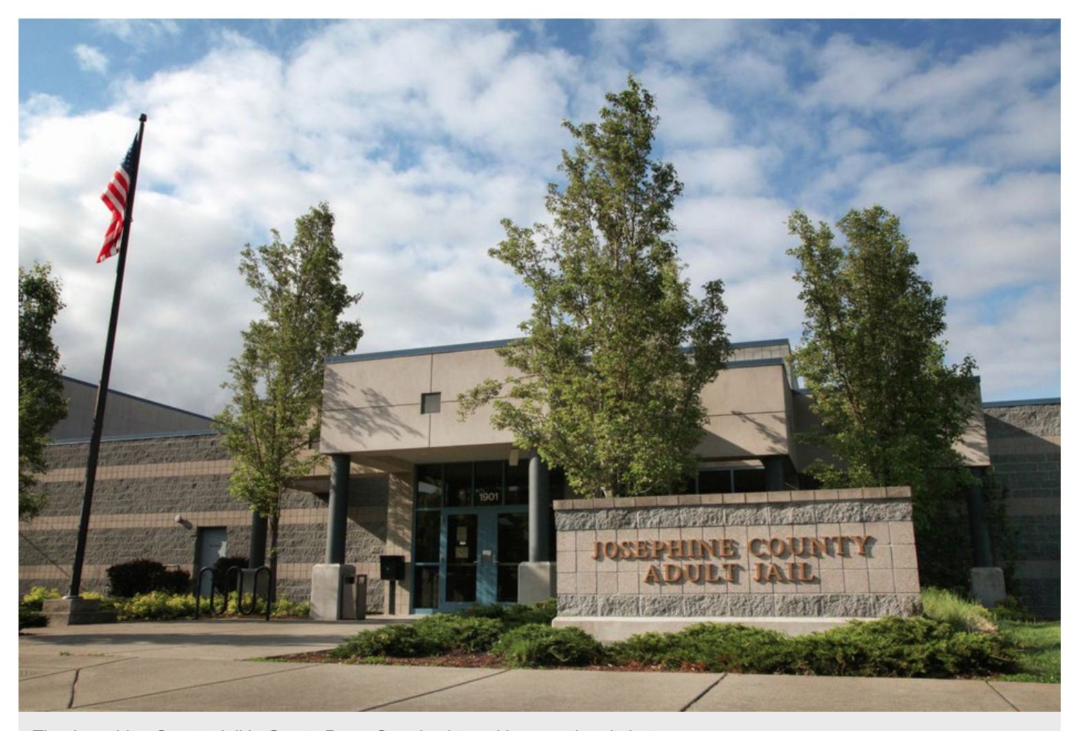
The Josephine County Jail in Grants Pass, Ore., is pictured in an undated photo.