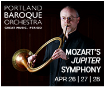
become a sponsor

About FAQs Employment Volunteering Internships Producing for OPB Accessibility Hire OPB Pressroom OPB Public Files