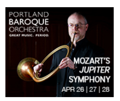
become a sponsor

About Contact Mobile Legal Support FAQs Podcasts Contribute Privacy Policy Email OPB Employment Newsroom Mobile Apps Sponsorship Terms of Use FCC Public Files & Accessibility Volunteering Connect Newsletters Philanthropy Internships Facebook RSS Feeds Planned Giving Editorial Policy Producing for OPB Twitter Vehicle Donations Contest Rules Accessibility Reception Issues Volunteering SMS T&C Hire OPB Pressroom OPB Public Files O AMERICAN PUBLIC MEDIA* BBC WORLD SERVICE