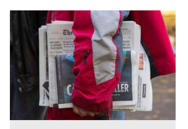
News Roundtable | 'Mother Winter'