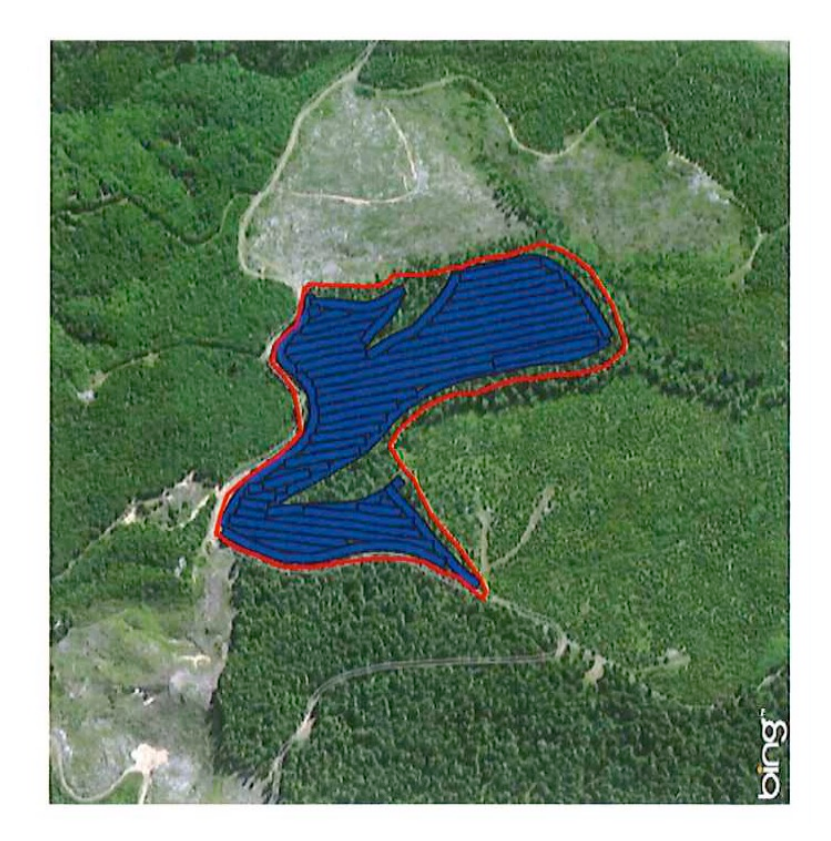
Figure 3 – GPS of flight lines for aerial pesticide applications on the OSU Research Forests Blodgett tract.