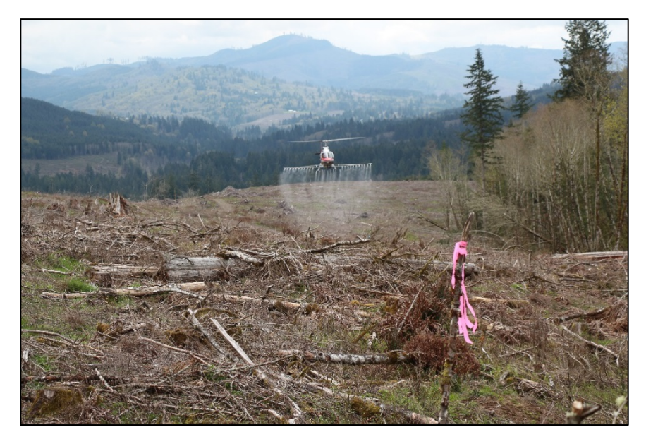
Figure 1 – Nozzle technology creates large droplet size which produce little drift.