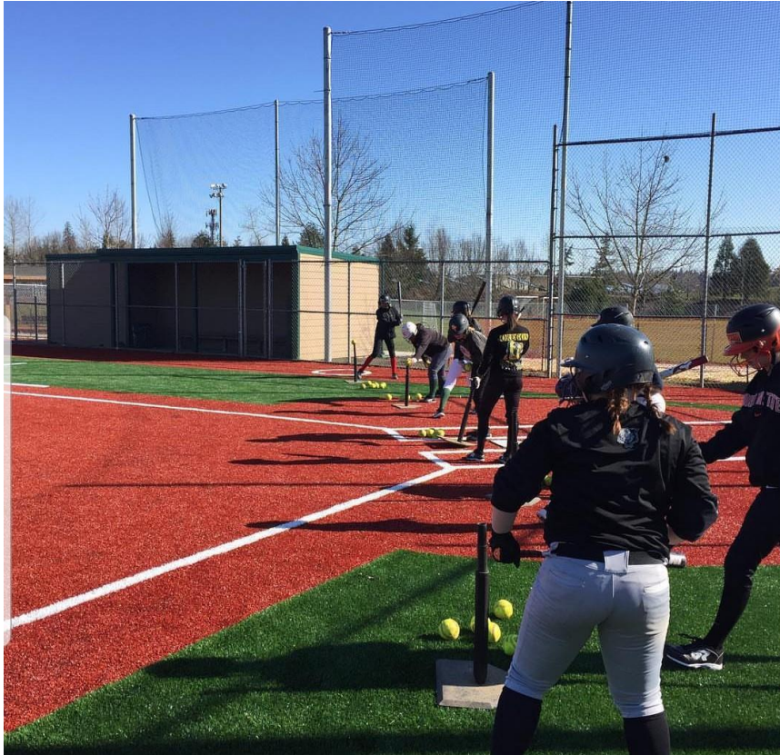
Tigard HS Softball Field