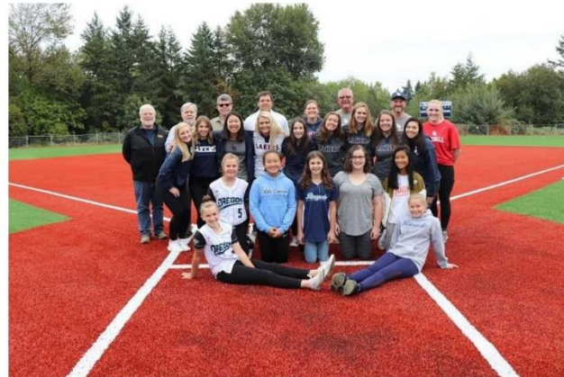
Members of past and

Some details still to be completed, but LOSD officials say the facility required by a Title IX settlement 'can be used now'