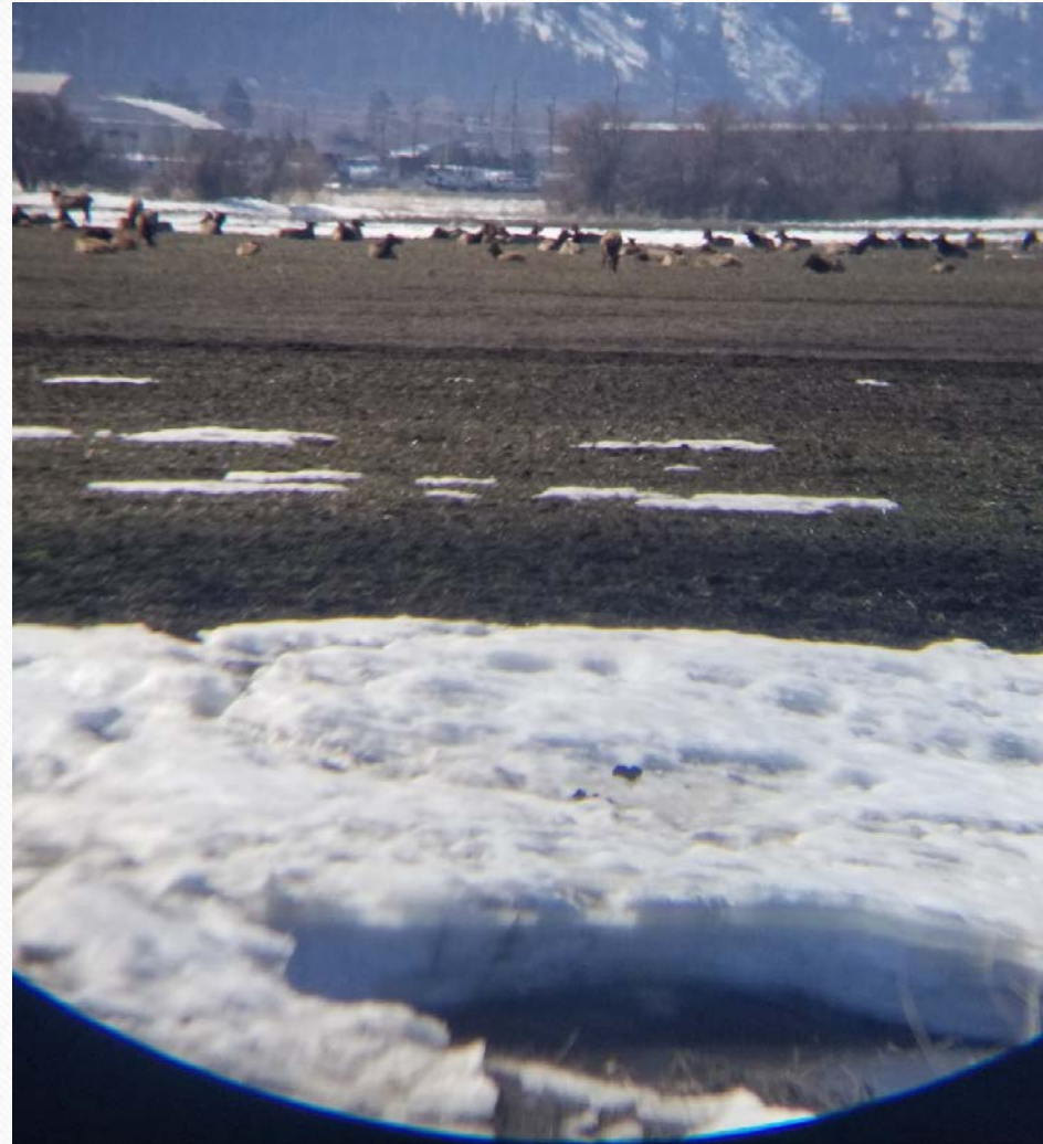
March 20,2019 Occupation and Damage Continues