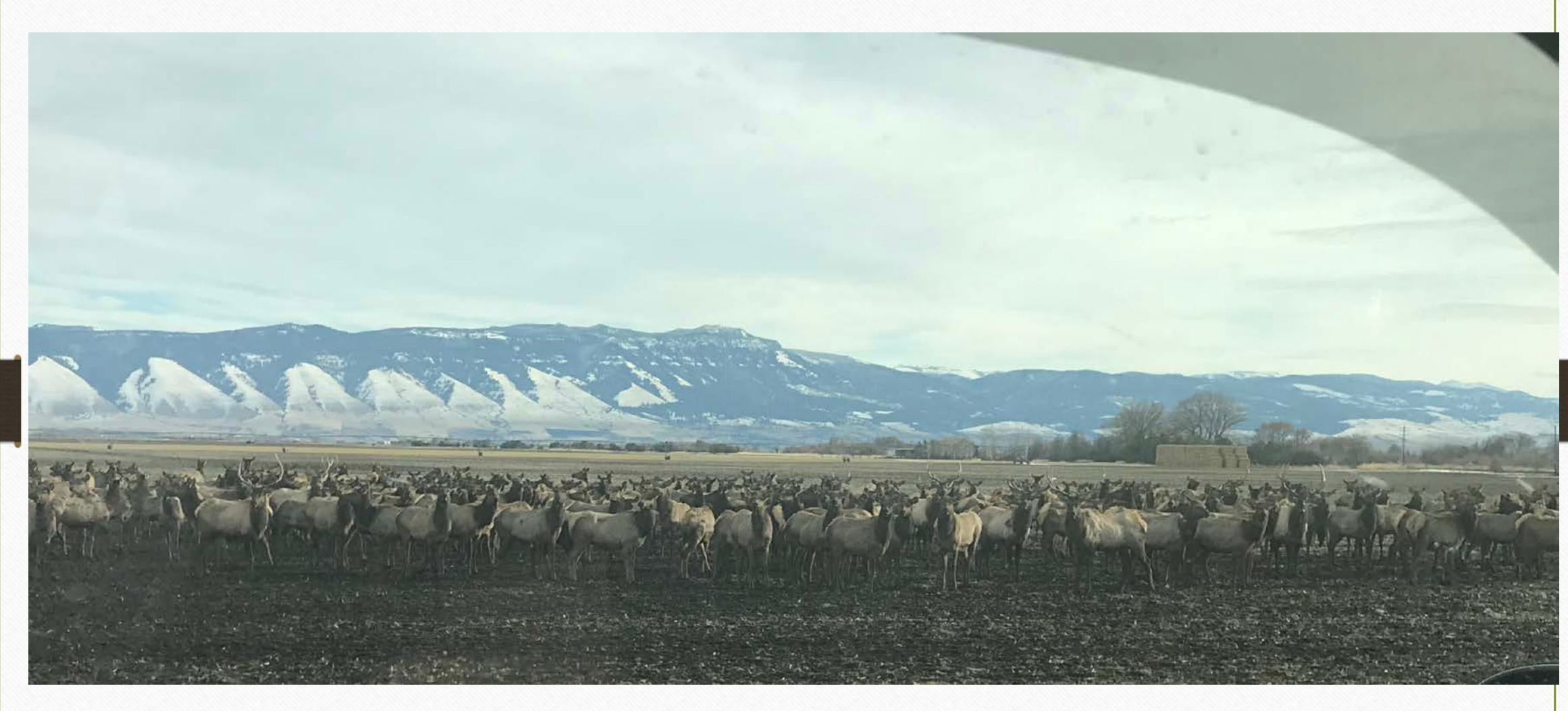
December 13, 2018