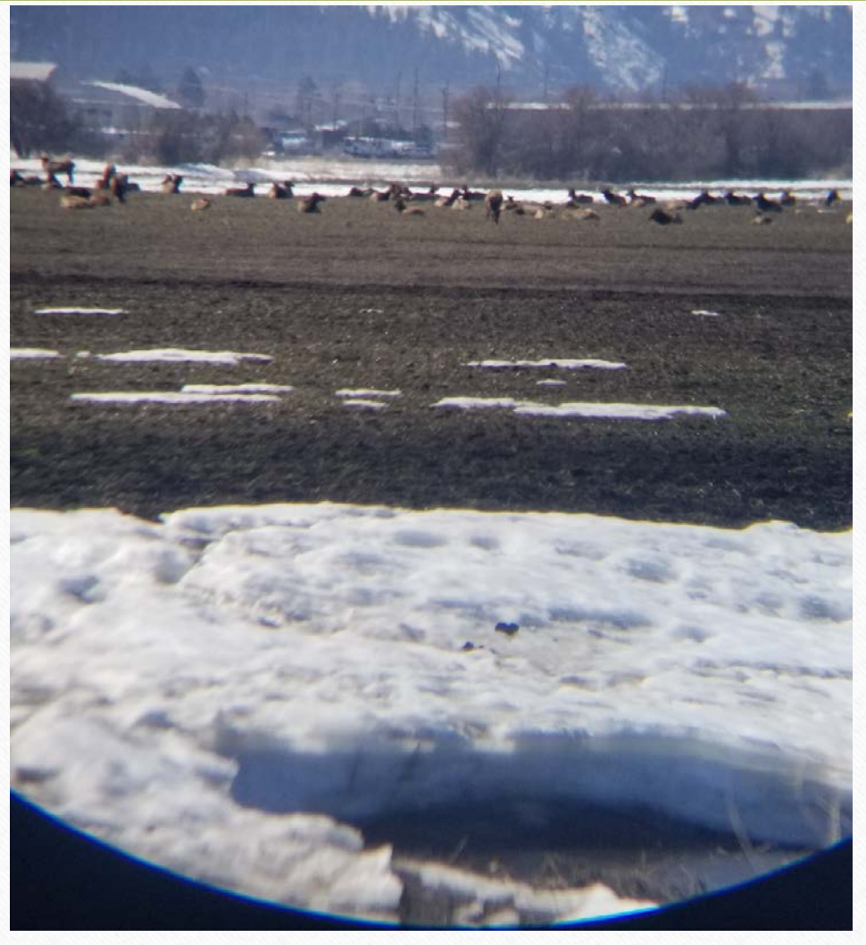
March 20,2019 Occupation and Damage Continues