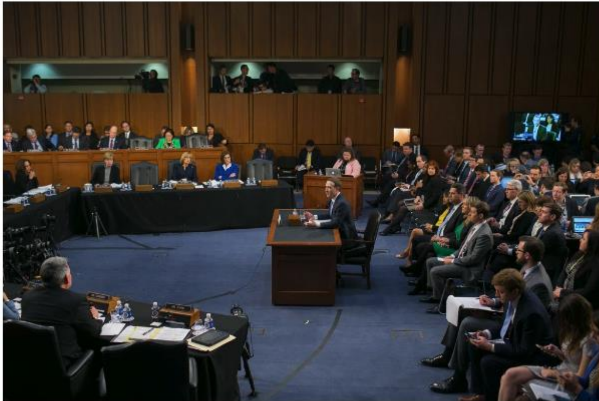
Mark Zuckerberg, Facebook's chief executive, testified at a joint hearing of the Senate Commerce and Judiciary Committees in April.