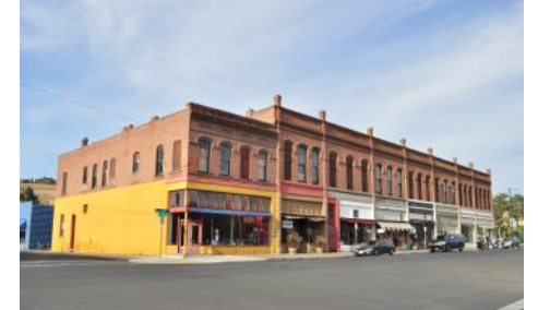
LaDow Block, Pendleton - Affordable Housing