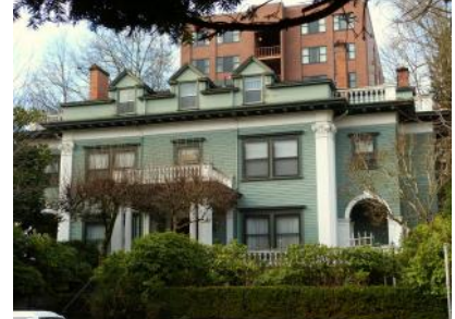
Isam White House, Portland - Conversion to multifamily housing