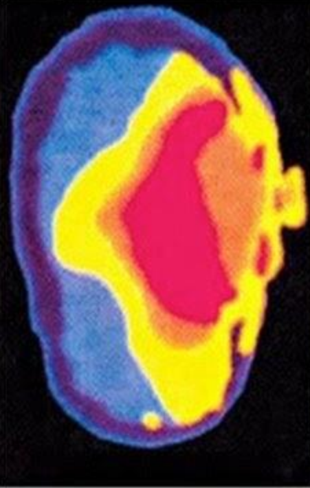
5 Year Old