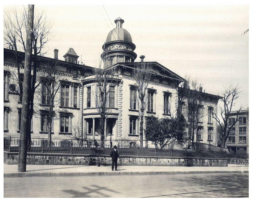
Old Multnomah County Courthouse circa 1900.

The first county law library in Oregon was Multnomah Law Library (MLL), which was incorporated in 1890 as a subscription library by a group of Oregon lawyers and set up inside the "Library Room" of the county courthouse (Multnomah Law Library: History, n.d.). By 1927, the Legislature had formally authorized the establishment of county law libraries: counties could pass a resolution declaring that they maintain and operate a law library "available at all reasonable times to the use of litigants, and permitted to be used by all attorneys at law duly admitted to practice in this state, without additional fees to such litigants or attorneys" (Or. Rev. Stat. § 9.840, repealed 2011), which directed the county clerk to collect fees for this purpose.