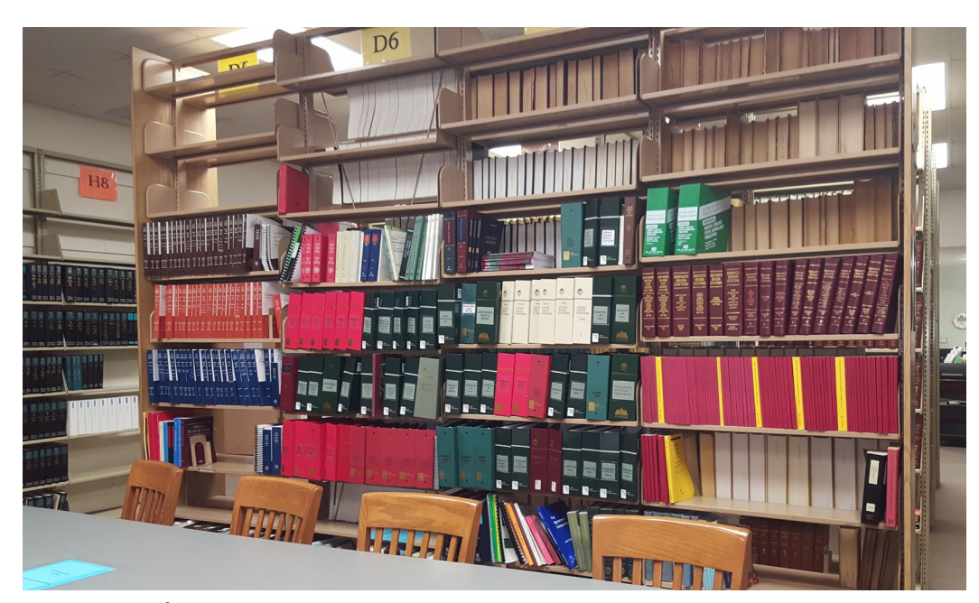
Interior view of CCLL.