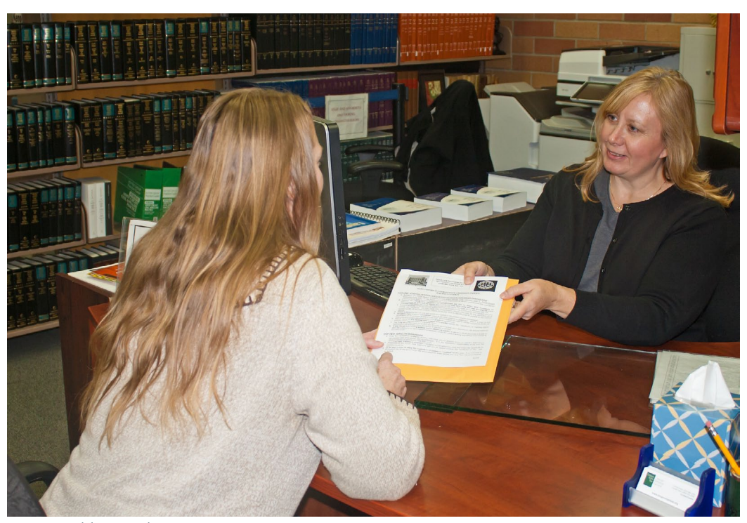
Patron and law packet at KCLL.

Most recently, KCLL has begun a "Lay Person Legal" public program series. The hourlong programs are held the third Thursday of select months in the public library meeting room and presented by local attorneys or Klamath County's Trial Court Administrator. The very first program, offered in spring 2017 on landlord/tenant law, drew a crowd of nearly 50 attendees! Other topics covered have included personal injury, marijuana law, and estate planning. The public library provides all of the promotion via local media, the library's newsletter, and publicity flyers in all branches of the KCLSD.