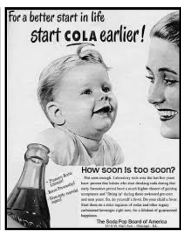
fed sugar-laden colas to babies.