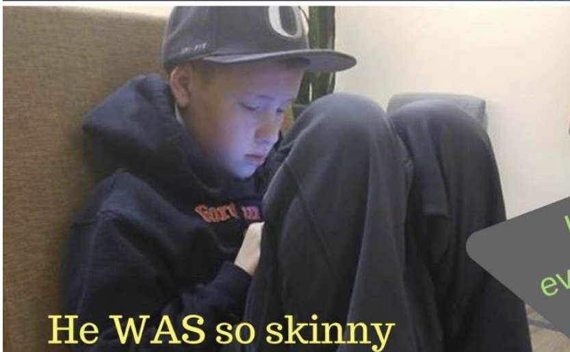
He WAS so skinny