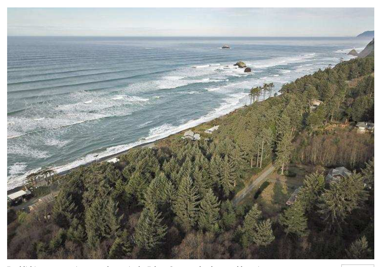
Establishing water service to new homes in the Falcon Cove area has been problematic.