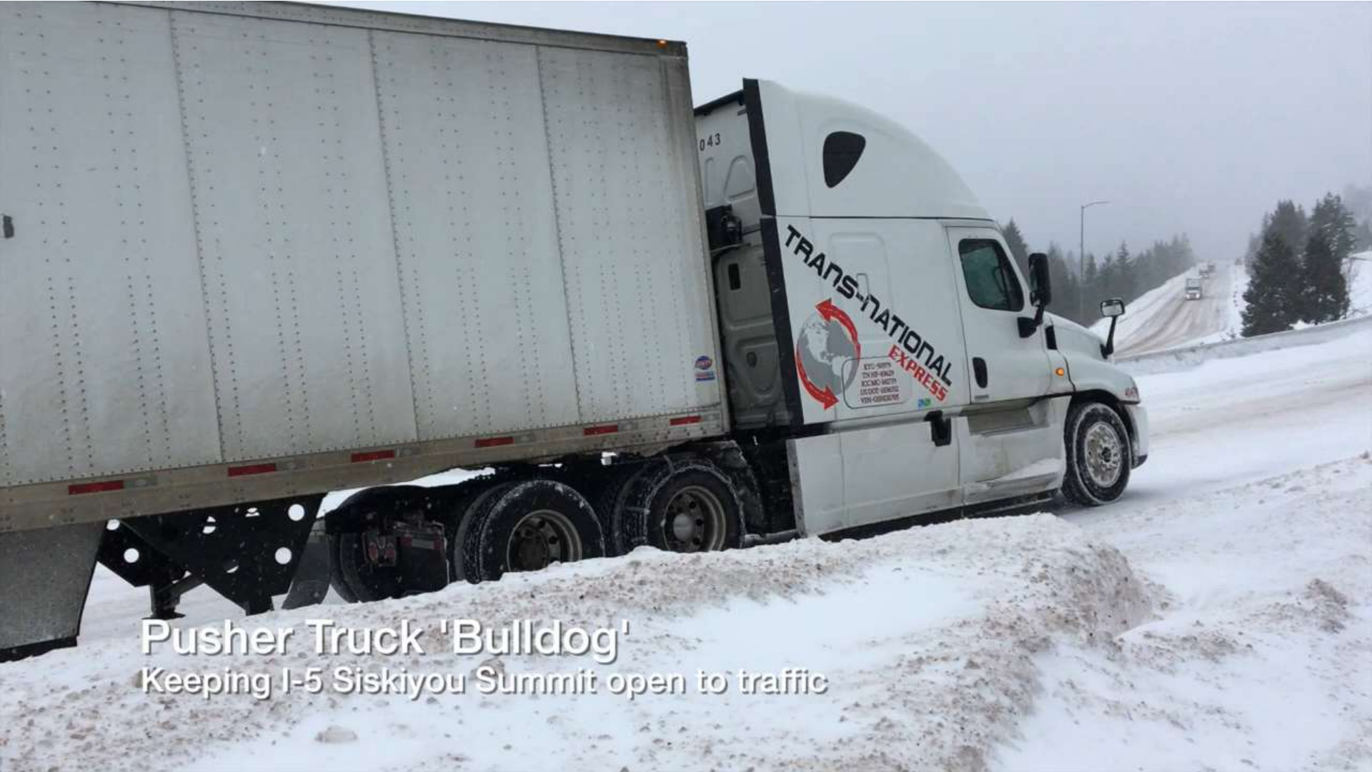
Pusher Truck 'Bulldog' Keeping I-5 Siskiyou Summit open to traffic