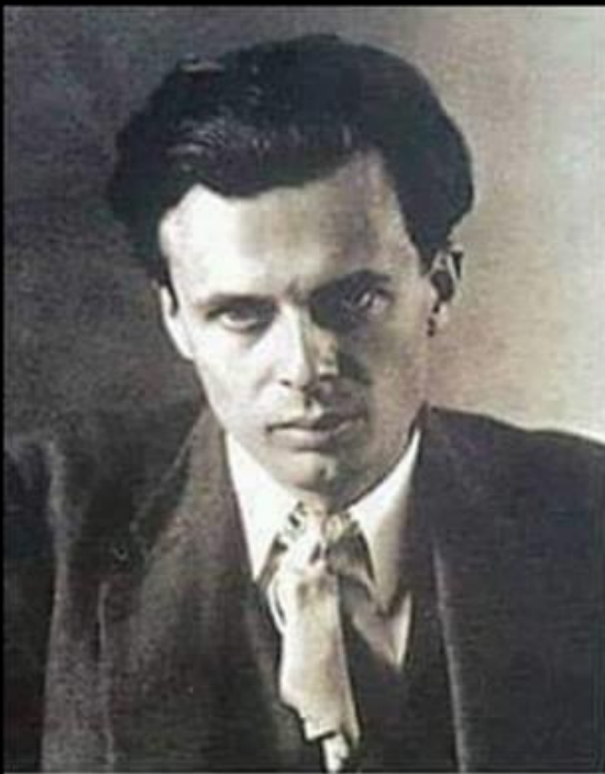
Aldous Huxley (1894-1963)

"There will be in the next generation or so a pharmacological method of making people love their servitude and producing dictatorship without tears so to speak. Producing a kind of painless concentration camp for entire societies so that people will in fact have their liberties taken away from them, but will rather enjoy it, because they will be distracted from any desire to rebel by propaganda, or brainwashing, or brainwashing enhanced by pharmacological methods. And this seems to be the final revolution."