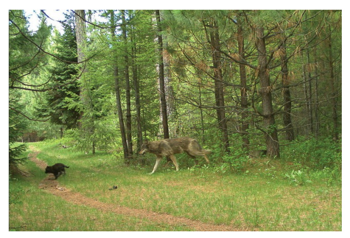
One subadult and one pup from the Catherine Pack on private property in eastern Union County, May 2017.