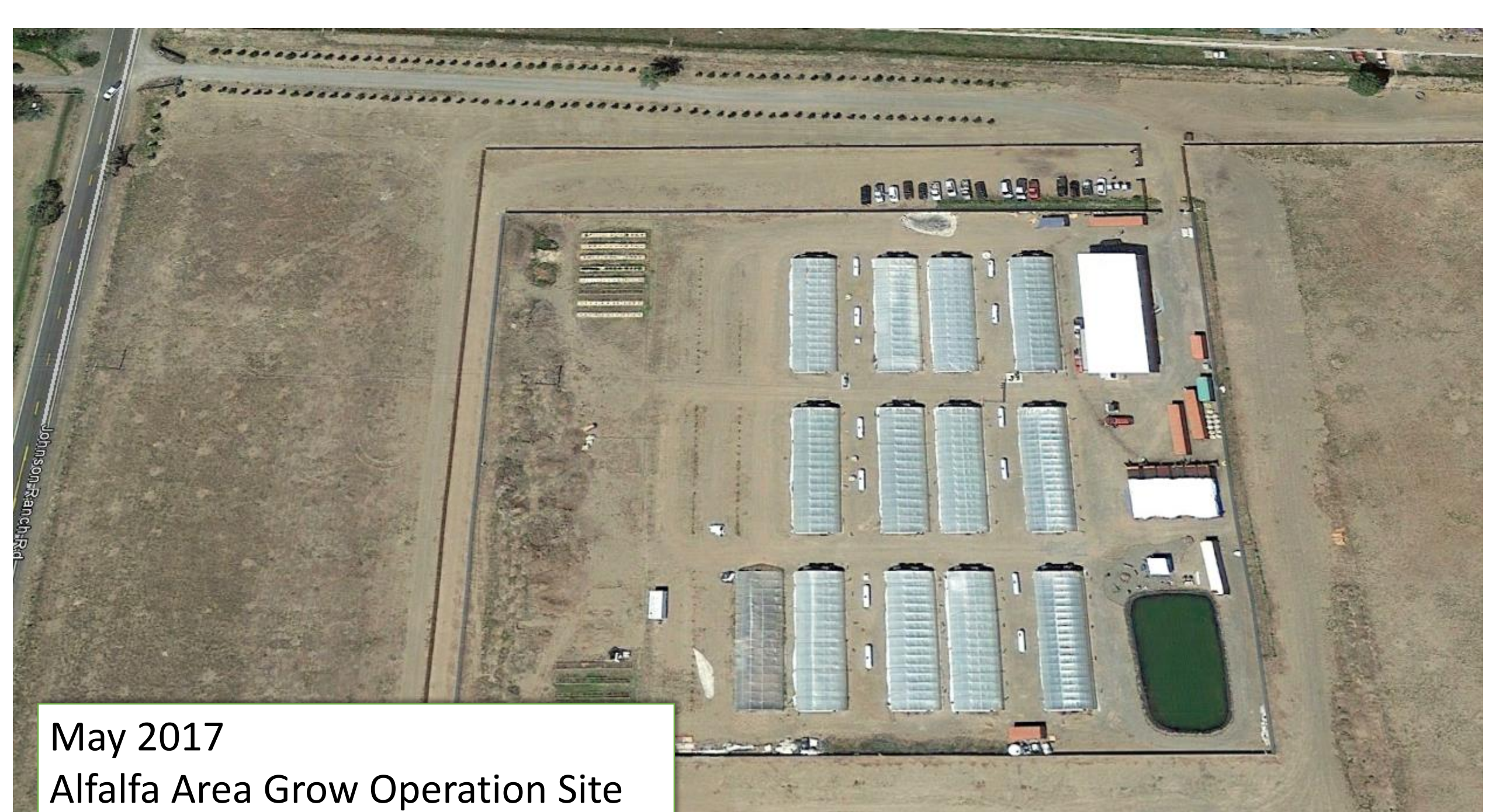
May 2017 Alfalfa Area Grow Operation Site