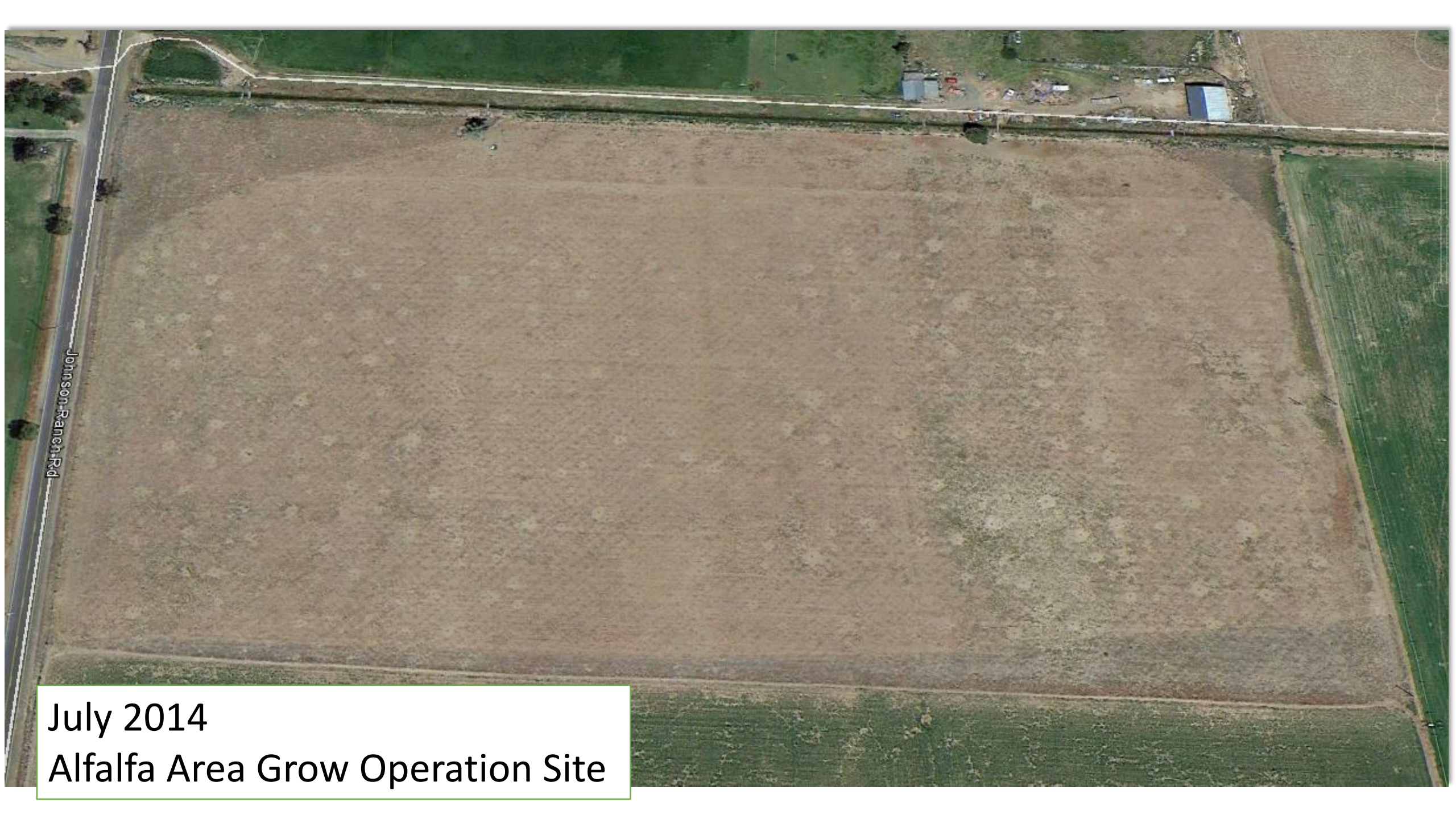
July 2014 Alfalfa Area Grow Operation Site