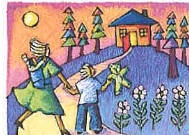
Formerly Mid-Valley Women's Crisis Service

The Center for Hope & Safety has been providing services to adults and children impacted by domestic violence, sexual assault, stalking and human trafficking for 45 years. We have seen firsthand the critical difference fair, stable, affordable and low-income housing makes for the thousands of victims and survivors we work with each year. In addition, the volatility of Oregon's rental market has more than doubled the amount of time victims are staying in our shelter. This reduces the availability of shelter beds for victims in need in our community and state.