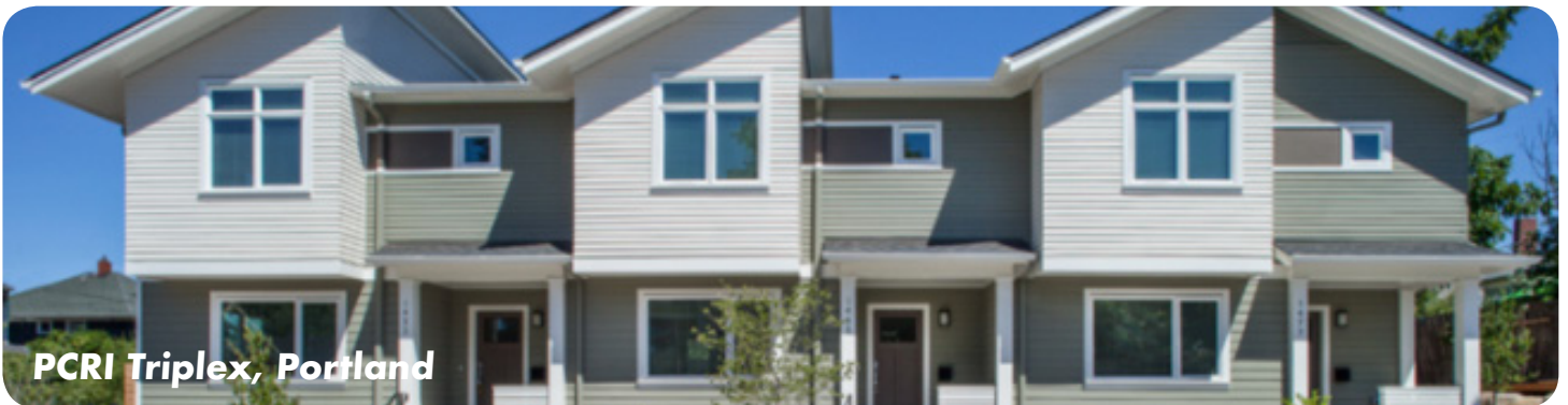
PCRI Triplex, Portland