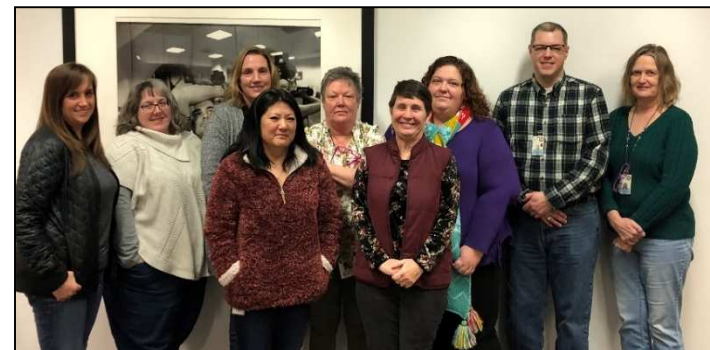
Post Adoption Team