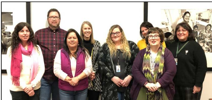
Legal Assistance/Adoption Team