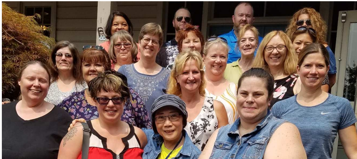
CHILD WELFARE PROGRAM