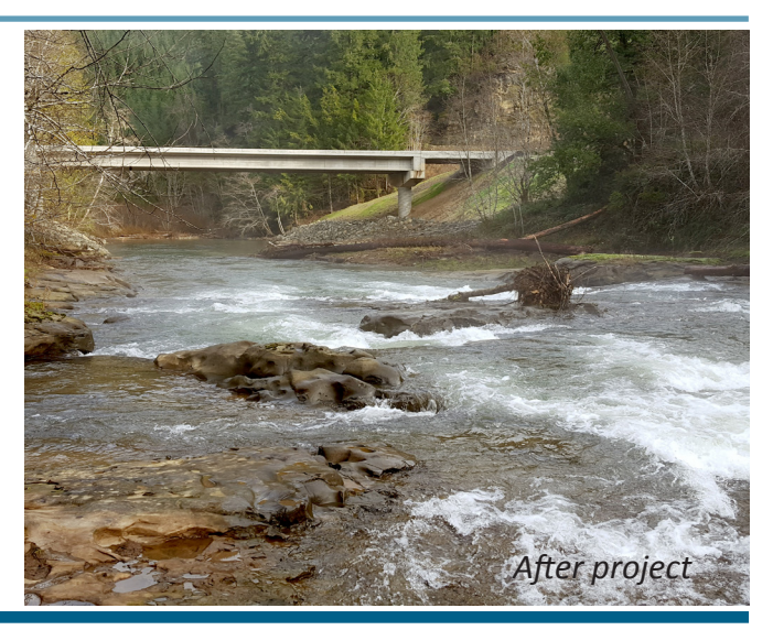
River reconnection photos