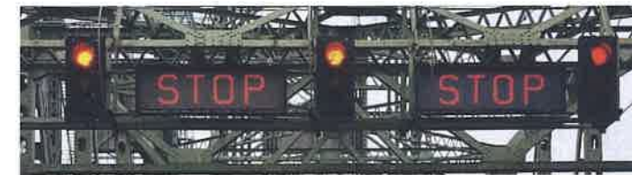
Century-old I-5 bridge only stoplight from Canada to Mexico