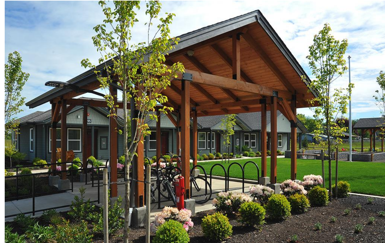
Seavey Meadows, Corvallis

Ending and Preventing Veteran Homelessness in Oregon