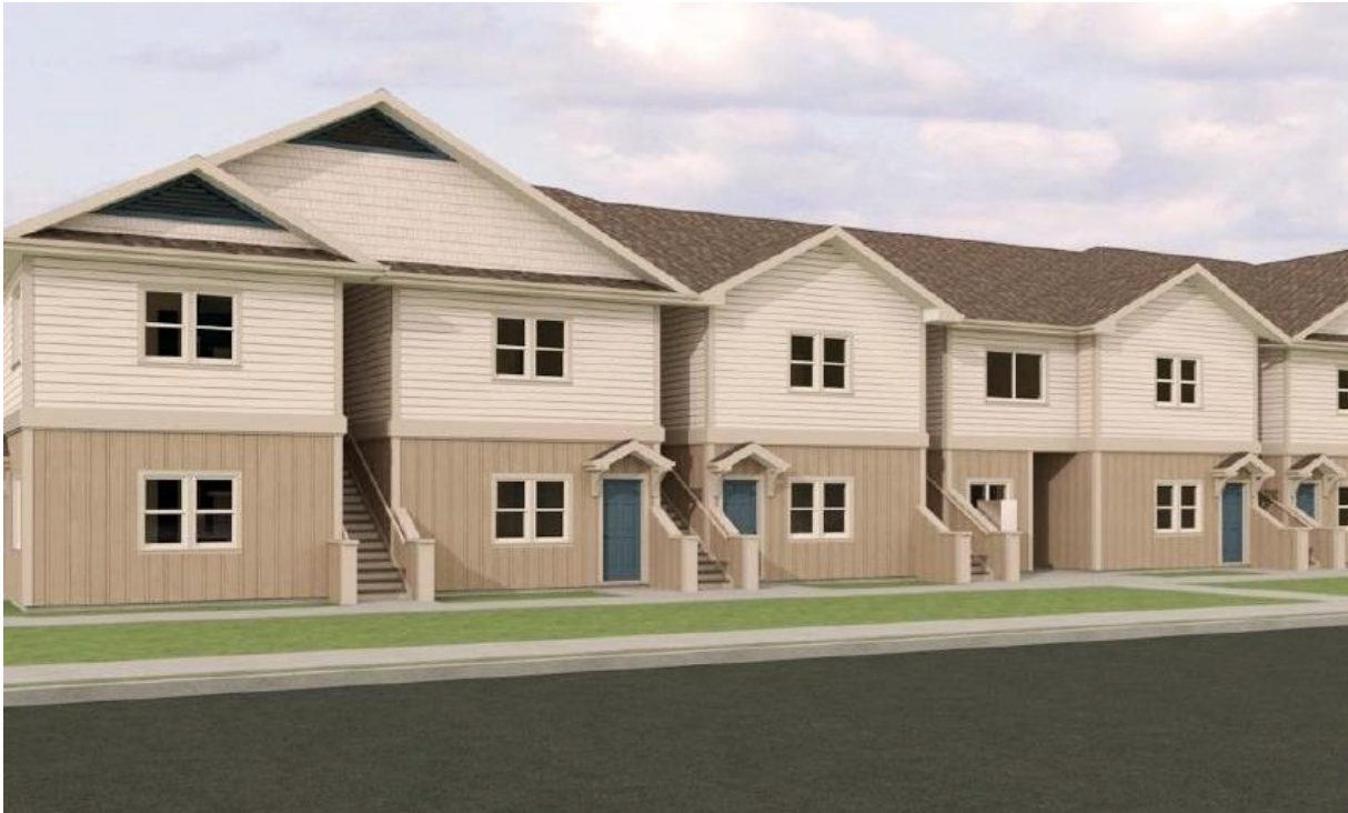
Victory Place, Medford