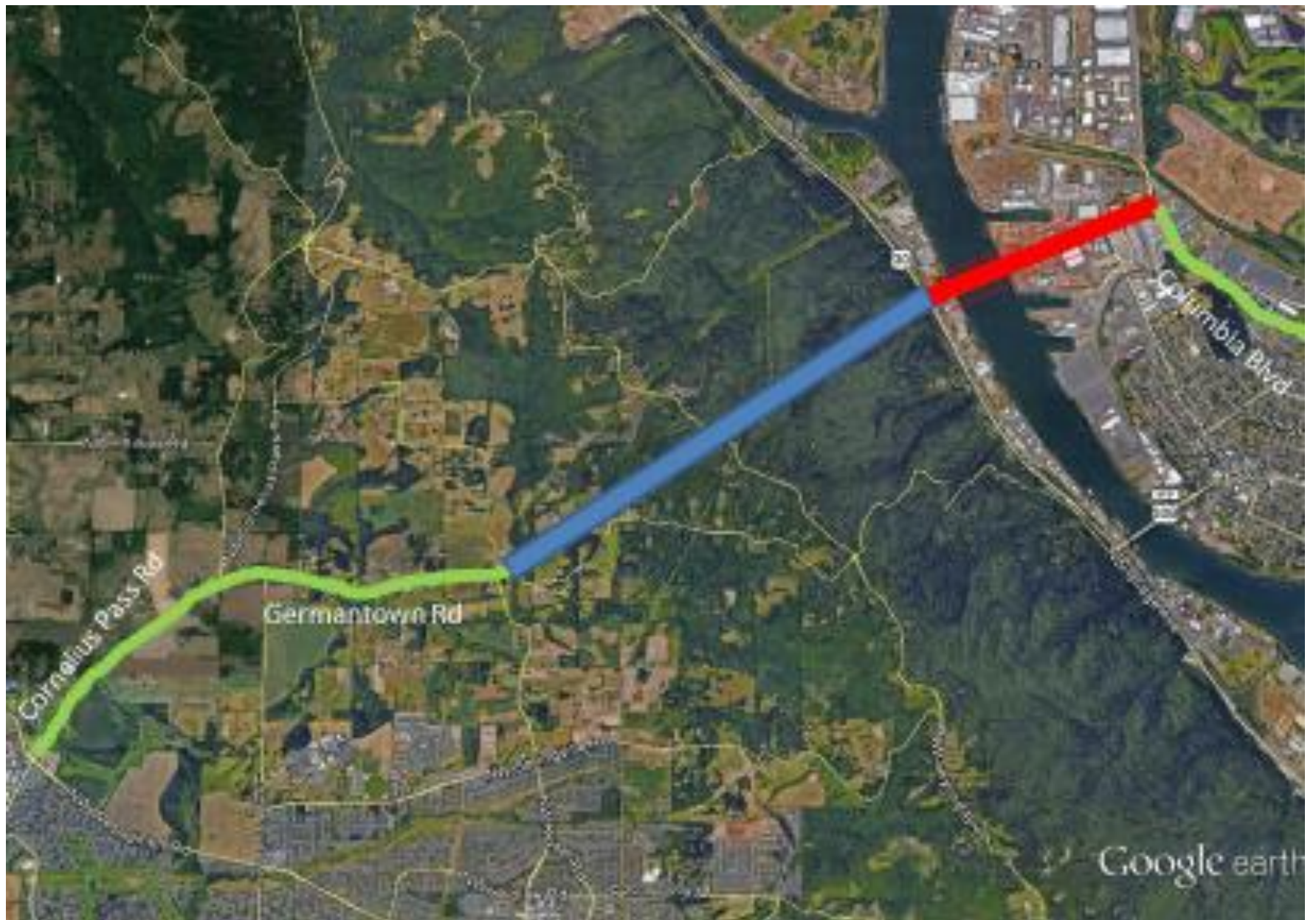
Northern Connector Concept