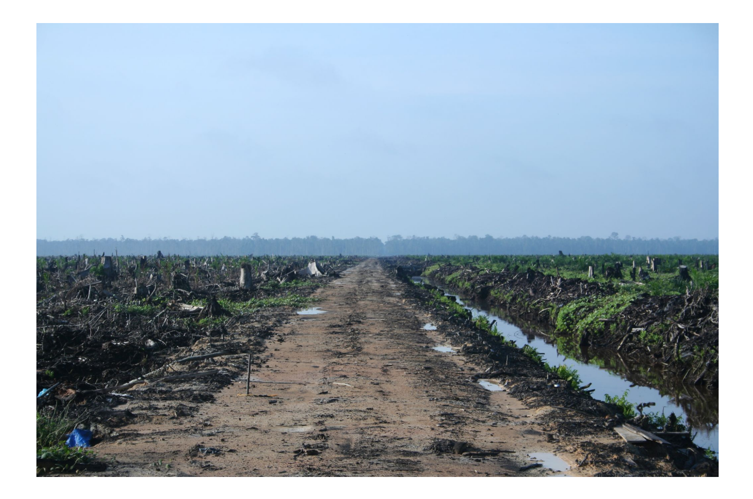
Figure 2. Vast tracts of rain forest are being leveled in Indonesia to make way for plantations to grow palm oil for bio-diesel. This was once habitat for rhinos and orangutans.