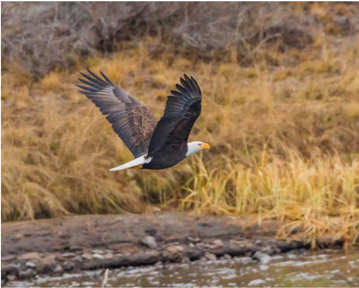
2018 Adult Bald eagle