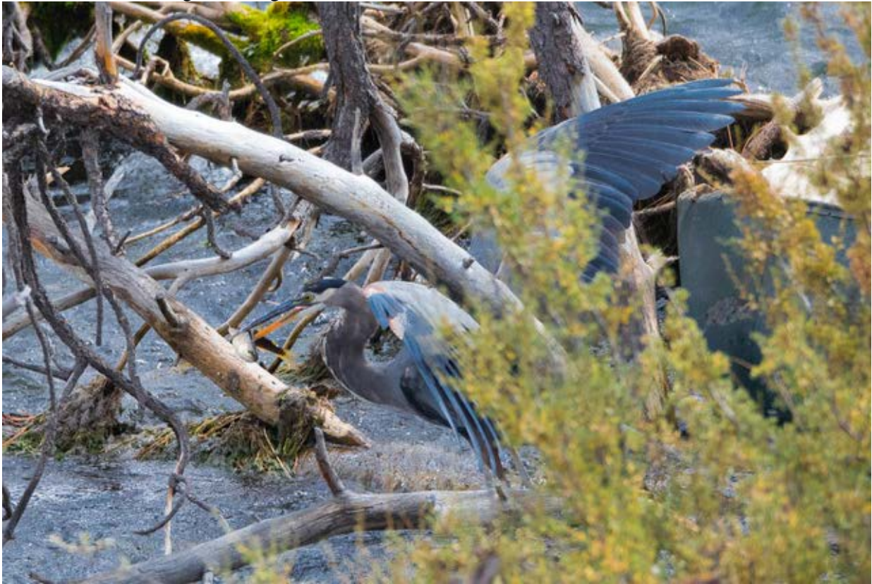
Aug 2017 Great Blue Heron catching a trout in the river