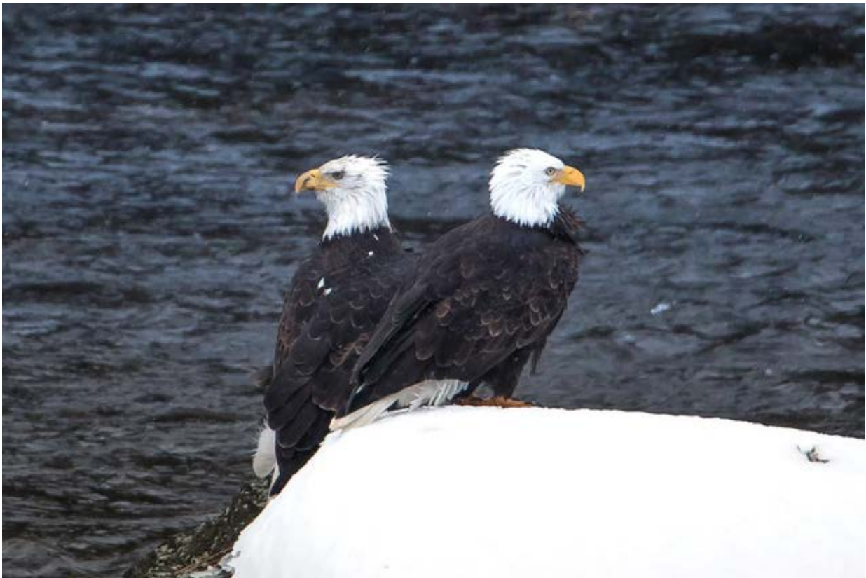
Feb.-11- 2018 Adult Bald Eagle with its off spring