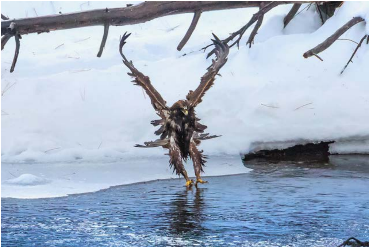
Feb 2017 Golden Eagle taking a plunge in the river