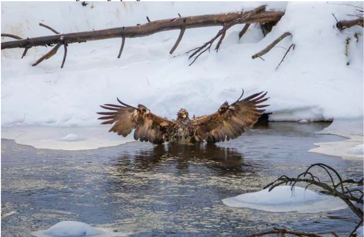
Feb 2017 Golden Eagle taking a bath in the river