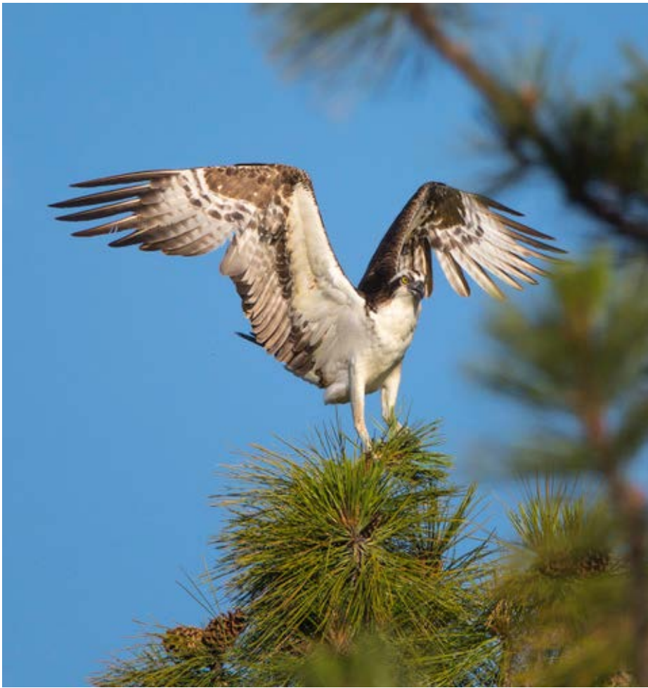
Feb 2018 Osprey