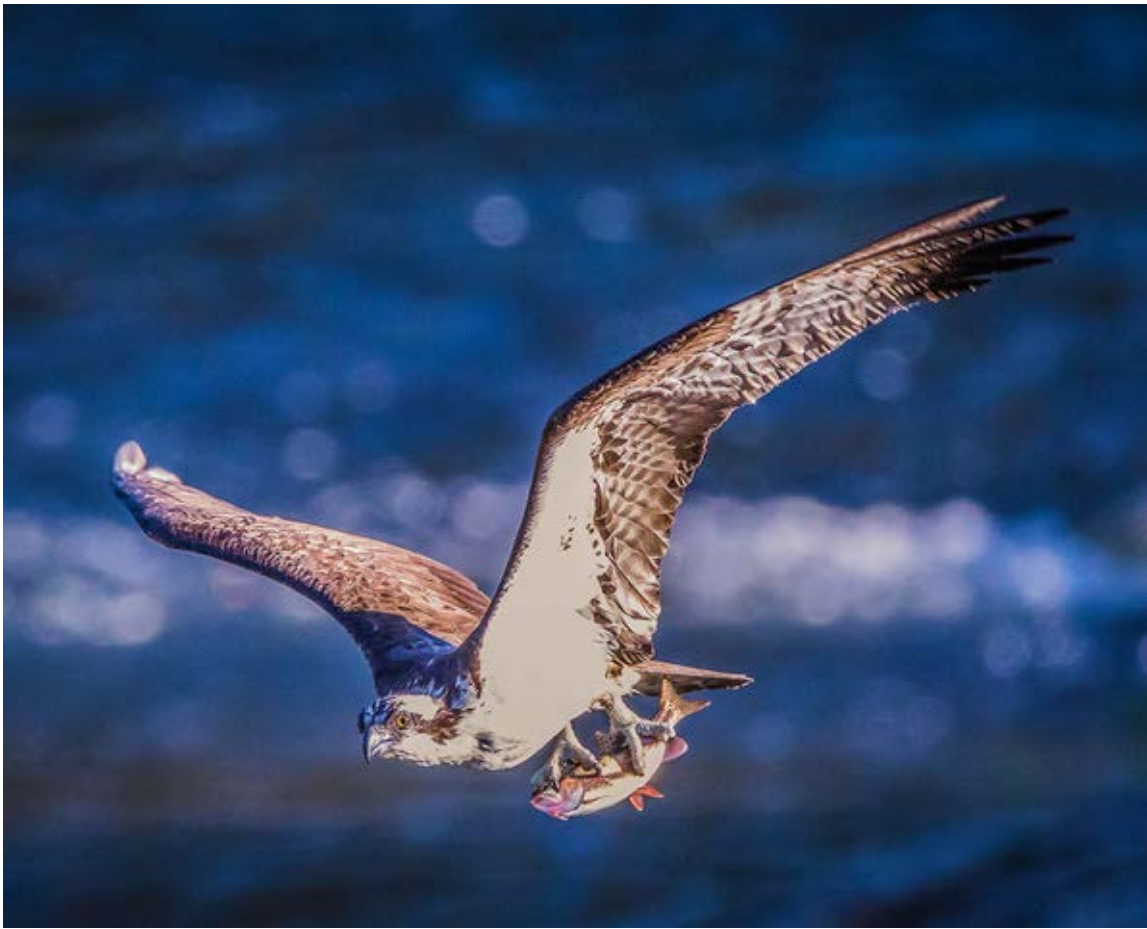
2017 Osprey with trout