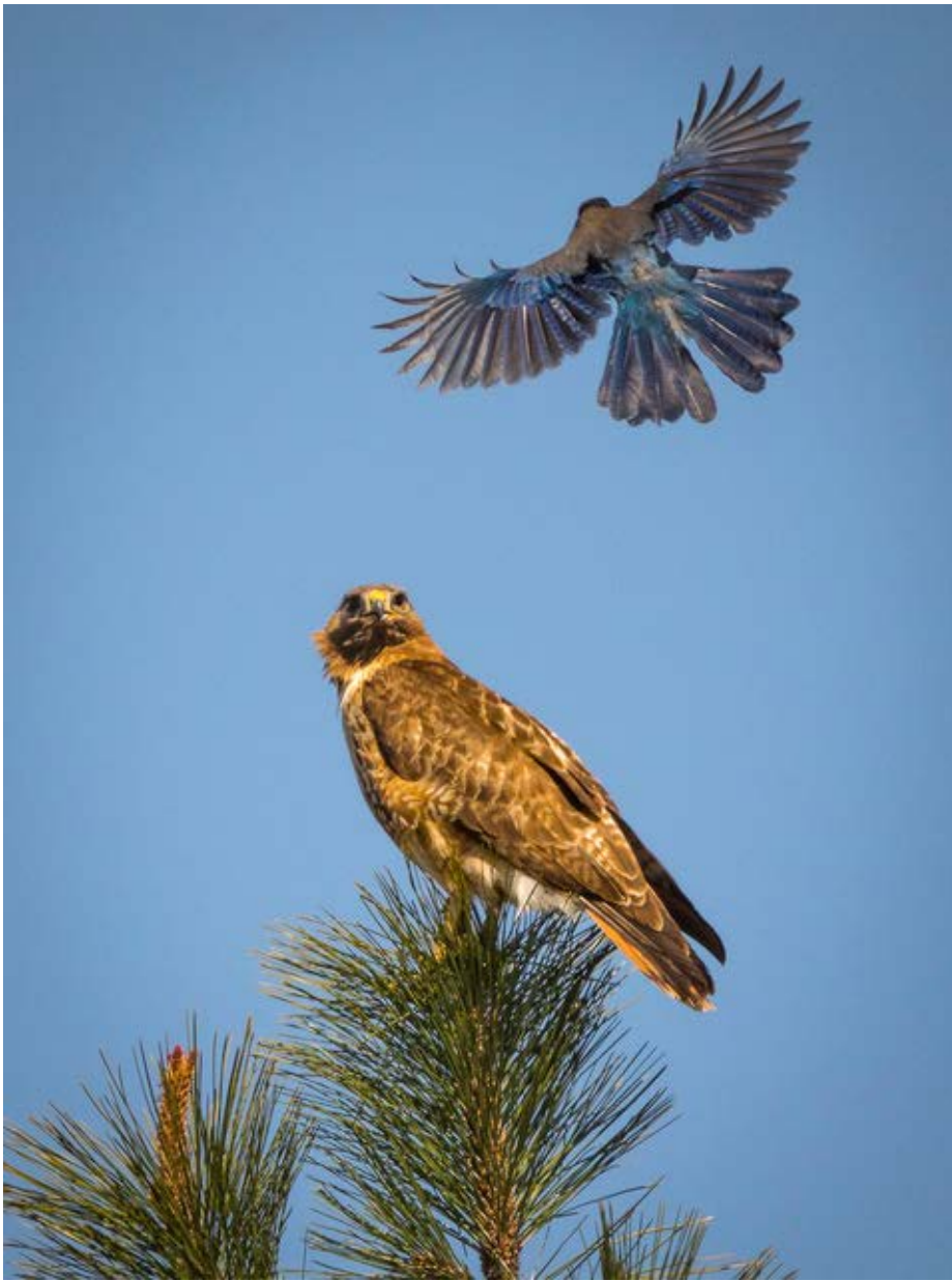
hawk being harassed by a Western Scrub Jay