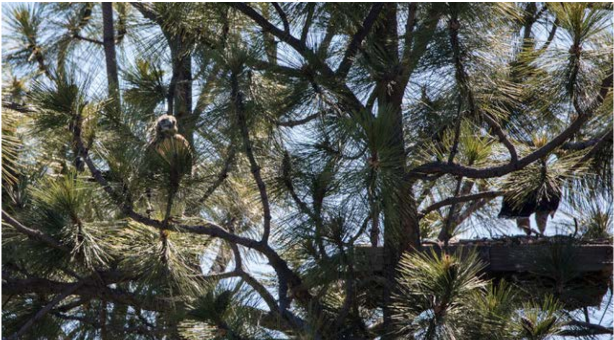
June 2017 Chicks getting ready to leave the nest