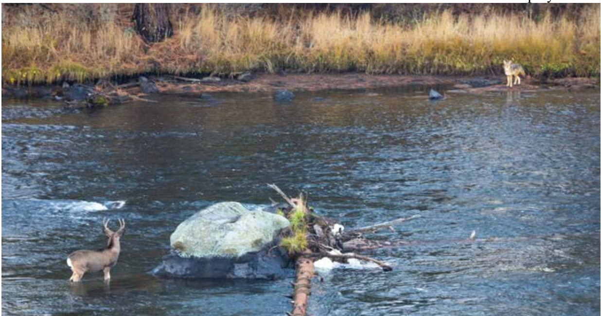
Sept. 2017 A coyote chased a buck into the river