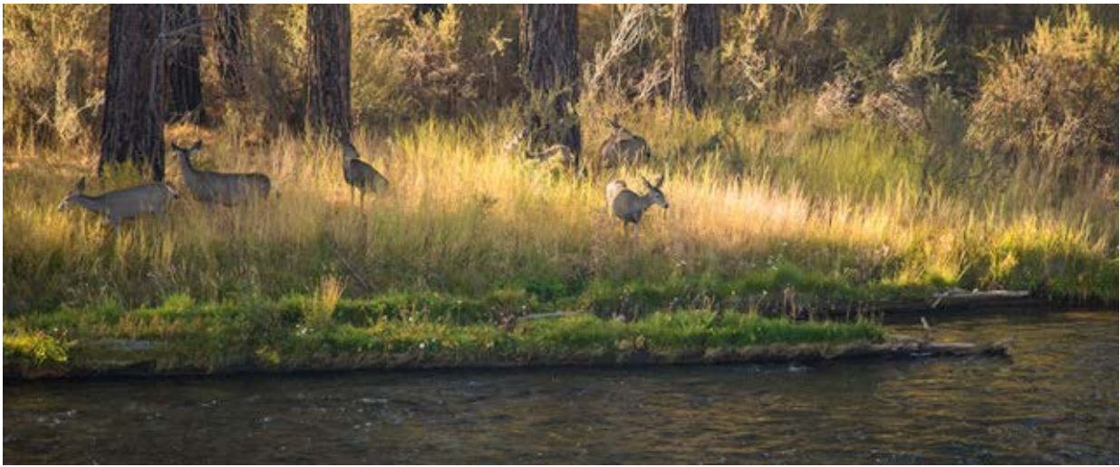
Sept. 2017 Herd of deer on the west side of the river