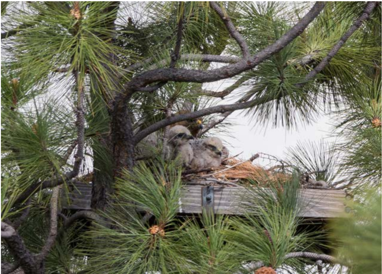
March 2017 Red-tail hawk with 2 young chicks nesting in one of the platforms built in the Helen M. Thompson Wildlife Sanctuary