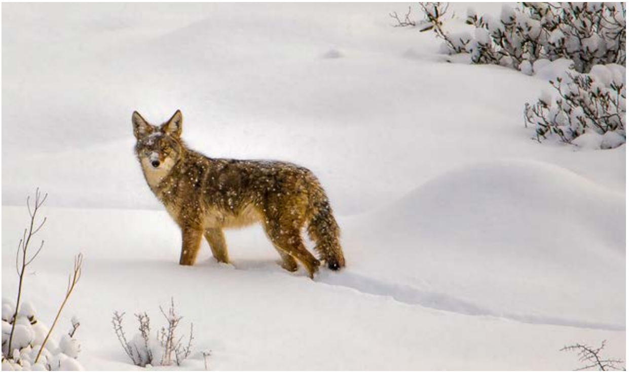
Jan. 2017 Coyote in the snow