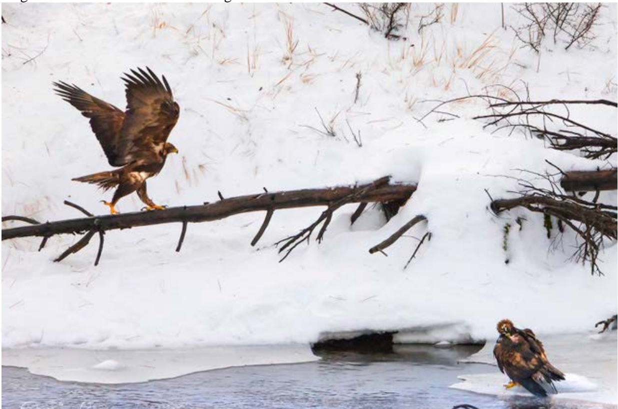
Feb 2017 Pair of Golden Eagles