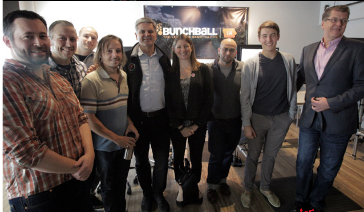
Des Moines, IA, ROTR 2.0, 2014 >