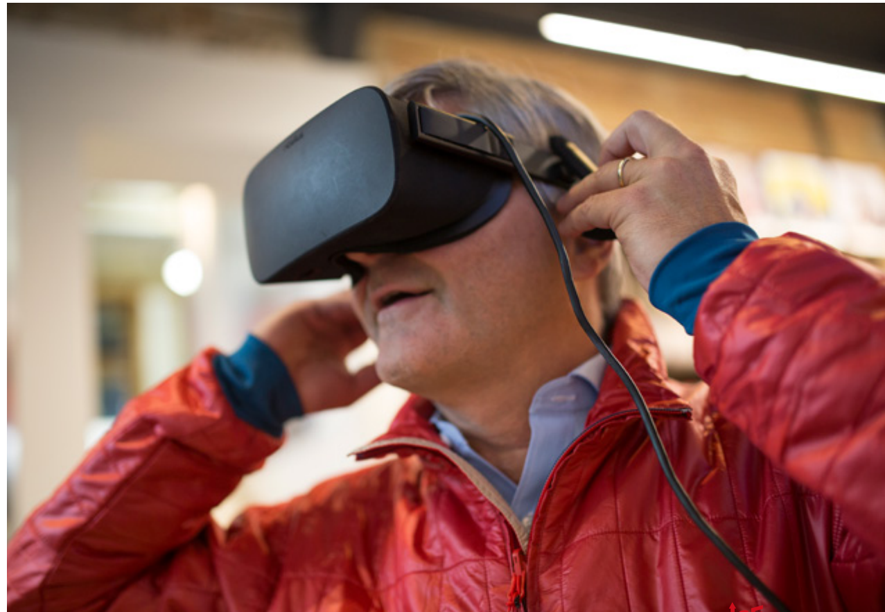
Steve Case at Cotopaxi — > Salt Lake City, UT, ROTR 5.0, 2016

The entrepreneurial ecosystem in Utah is a unique blend of tangibles like supportive government resources and strong capital support from investors like Shark Tank's Barbara Corcoran and intangibles like the pay-it-forward attitude shared by the community of entrepreneurs and those who support them. These factors make it an attractive place investors and entrepreneurs alike, and the winters aren't too bad either. </>