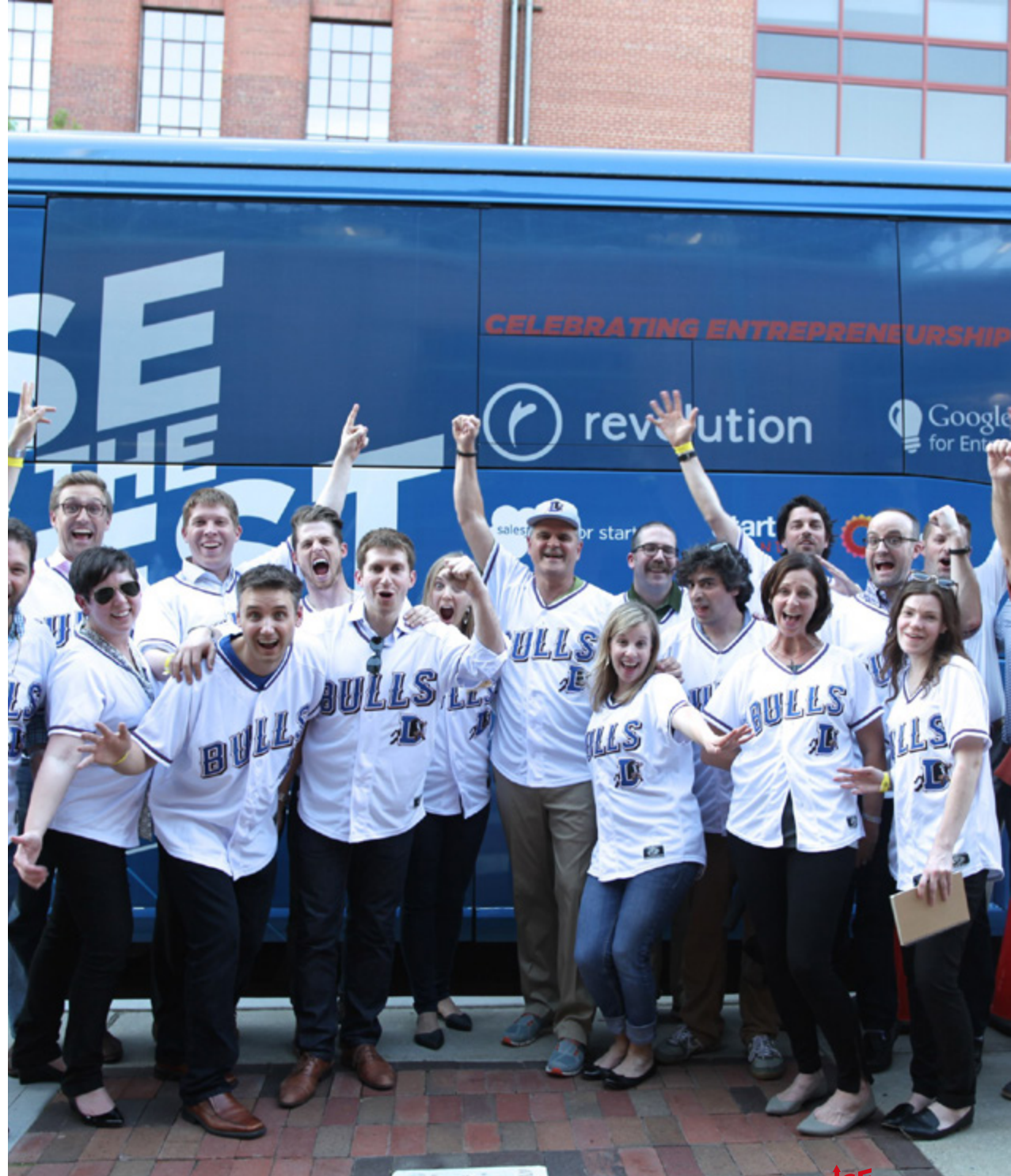
Raleigh-Durham, NC, ROTR 3.0, 2015 >

Carpe is now part of Durham's ecosystem, but it has roots in Duke I&E and grew through one of the initiative's programs. As more students continue to take advantage of Duke I&E over the last several years, the university's contributions to Durham's entrepreneurial ecosystem continue to become more frequent and robust. </>