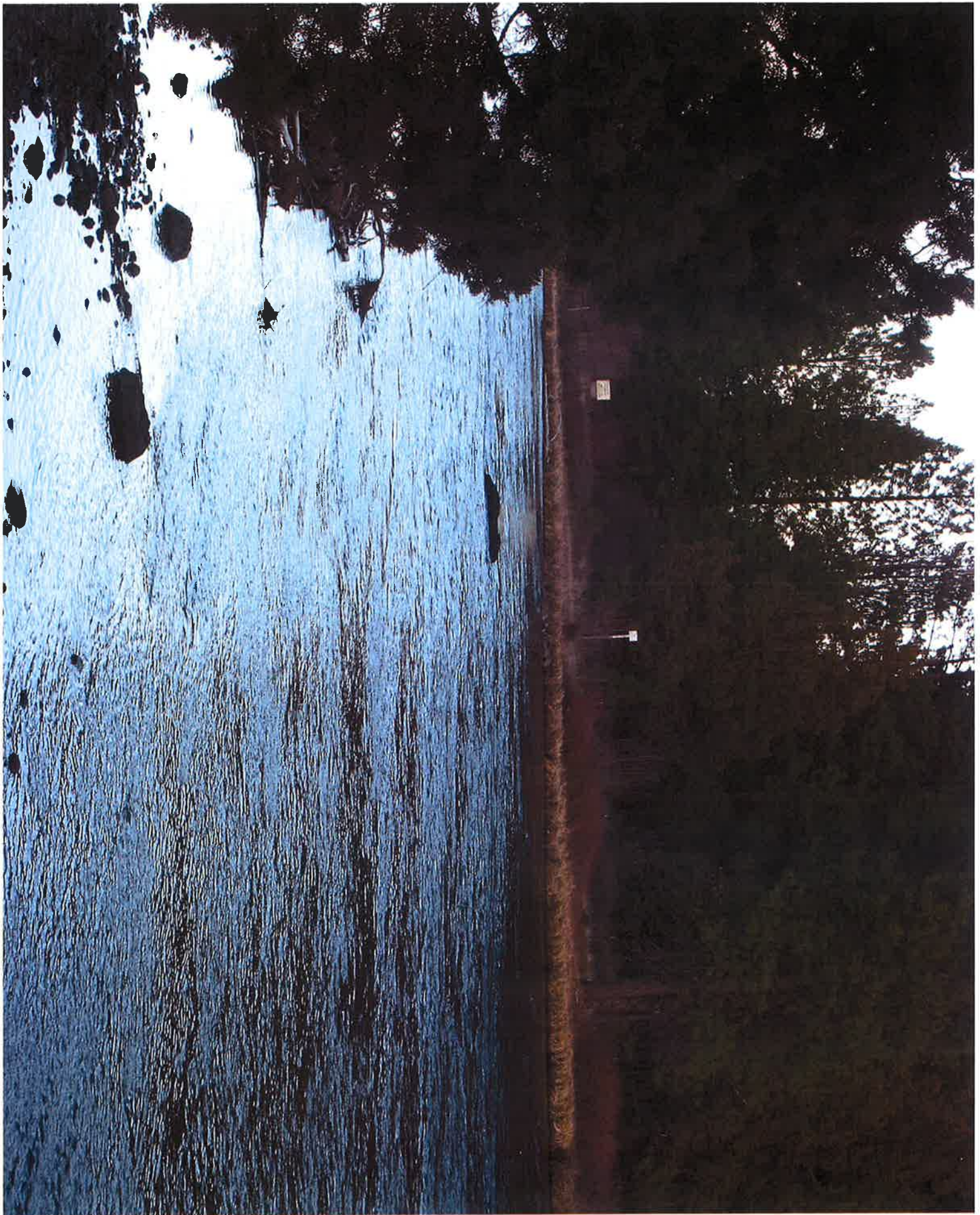
ON WEST SIDE BRIDGE SITE LOOKING AT SANCTUARY ON EAST SIDE - # 292 NOTICE WILDLIFE SANCTUARY SIGNS