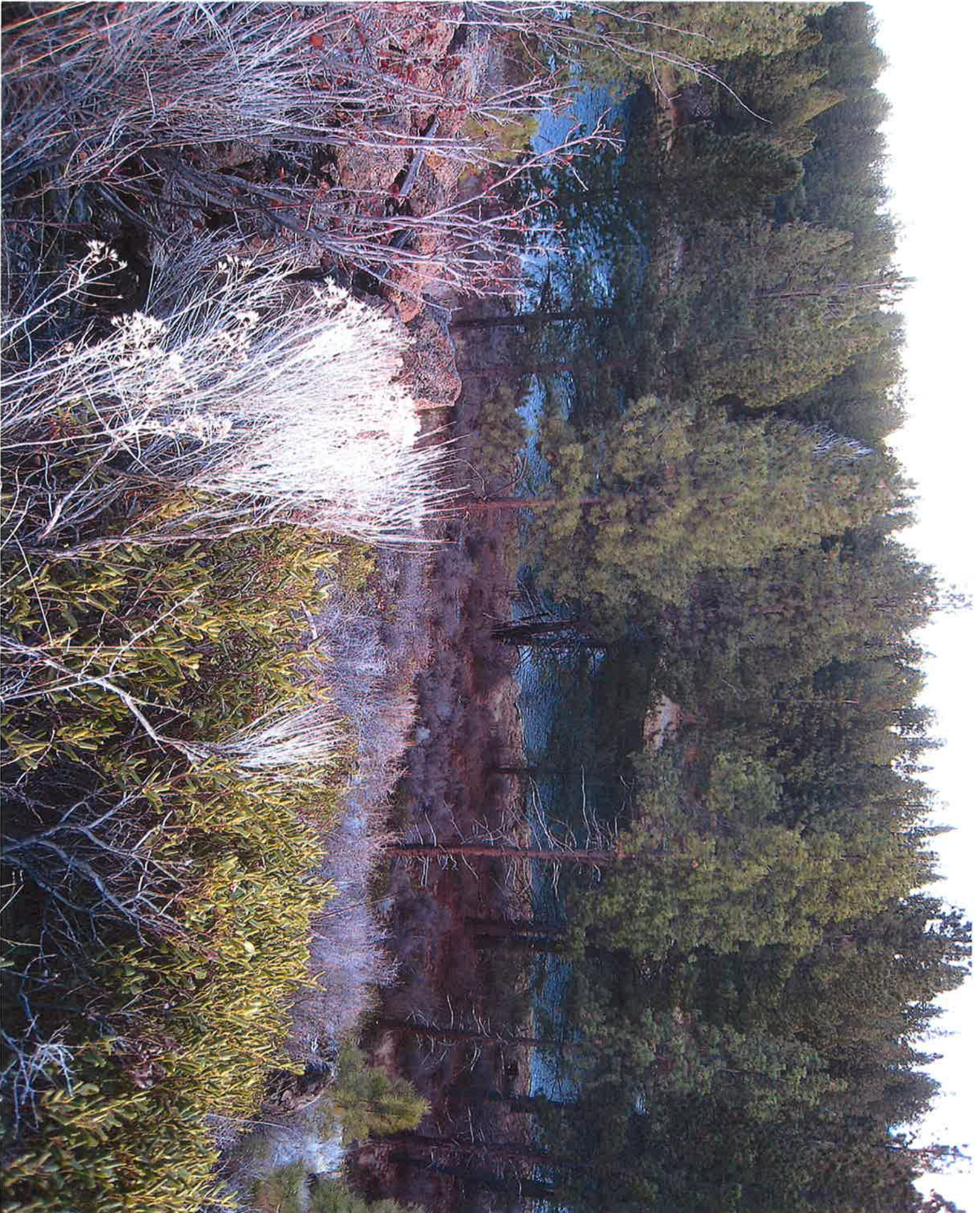
ON WEST SIDE LOOKING ACROSS RIVER BRIDGE SITE # 29D IN DOG PARK