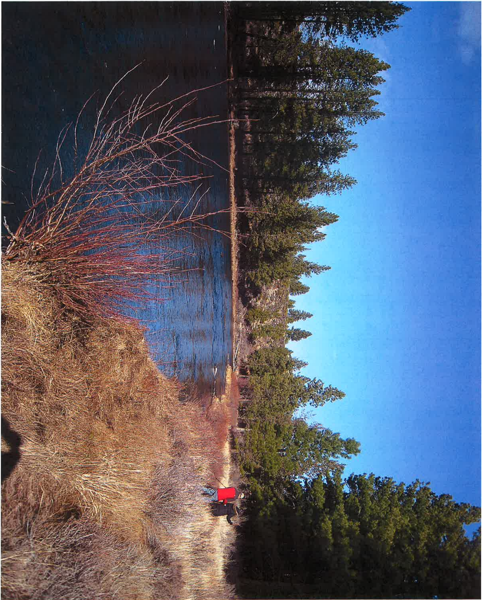
EAST SIDE LOOKING DOWN RIVER - BRIDGE SITE DO & PARK OPPOSITE SIDE