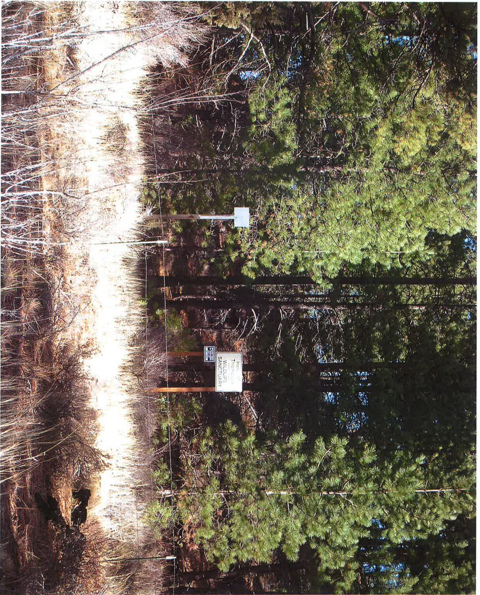
EAST SIDE LOOKING AT SANCTUARY