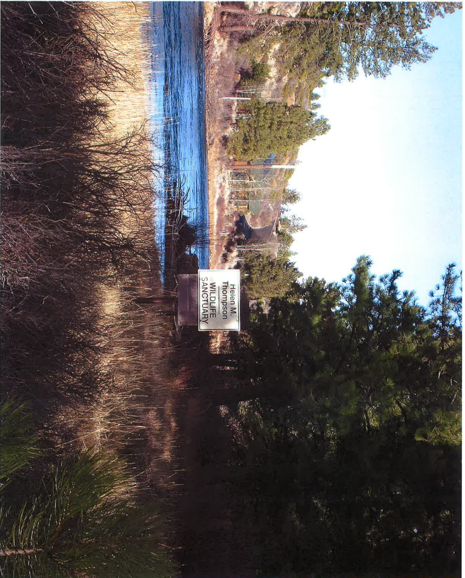
ON EAST SIDE LOOKING AT WILDLIFE SANCTUARY - BRIDGE SITE # 279