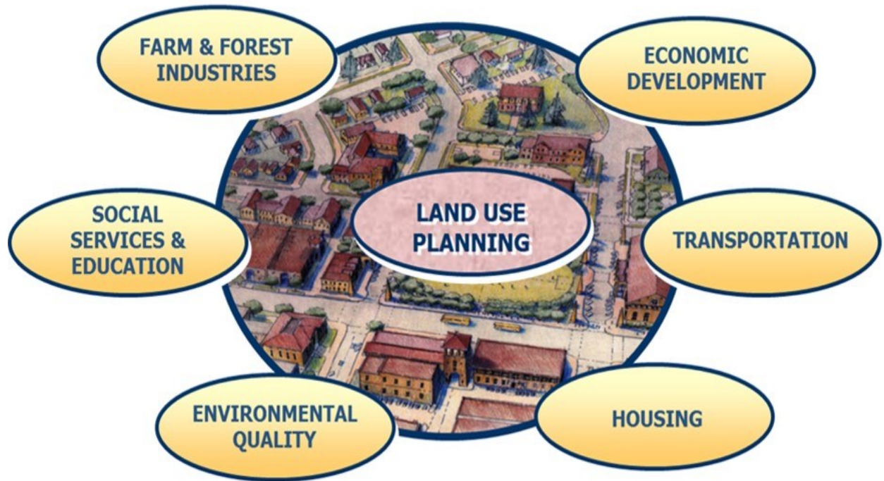
DLCD Presentation; Slide #4