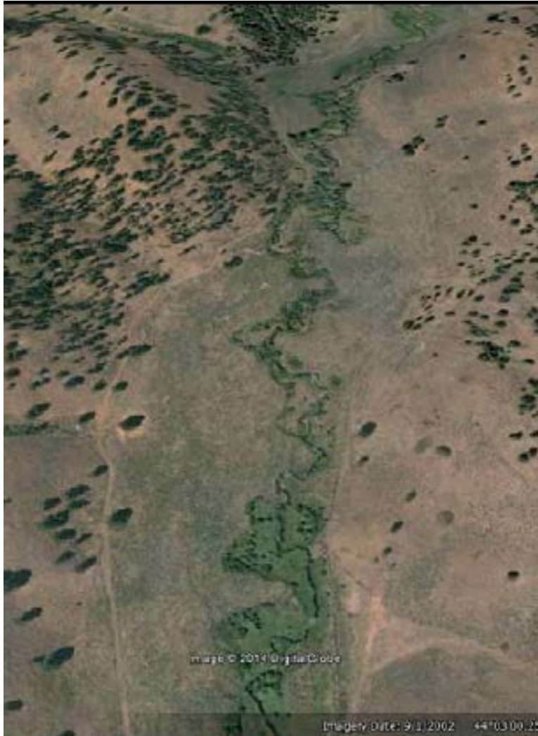
September 1, 2002