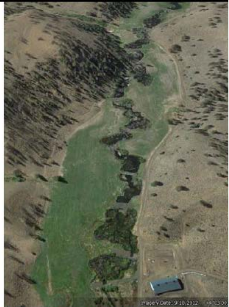
September 10, 2012