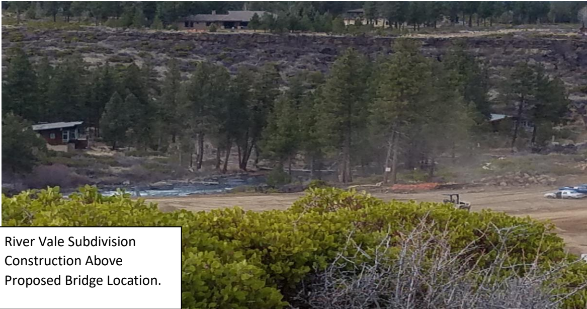
River Vale Subdivision Construction Above Proposed Bridge Location.