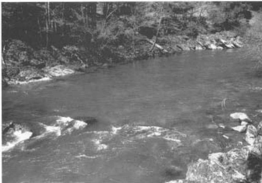
This is the same site in spring of the following year. The log at water's edge in the upper, center-right of this photograph is visible in the upper center of the photo above.