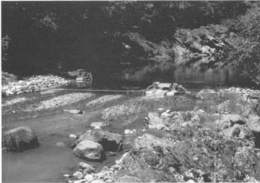
A miner works upstream of these dredges in Butte Creek, California, at a depth of greater than 2 meters.