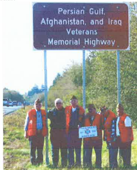
Persian Gulf, Afghanistan and Iraq Veterans Memorial Highway sign on US Hwy 101 near Warrenton