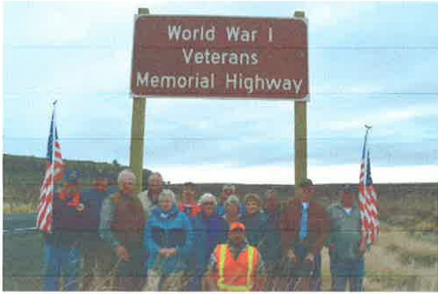
WWI Veterans Memorial Highway sign on US Hwy 395 near Burns