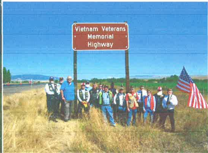
Vietnam Veterans Memorial Highway sign on Interstate 84 near La Grande