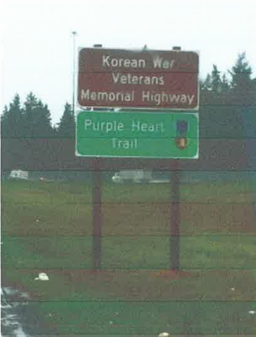
Korean War Veterans Memorial Highway and Purple Heart Trail signs on Interstate 5 near Tualatin