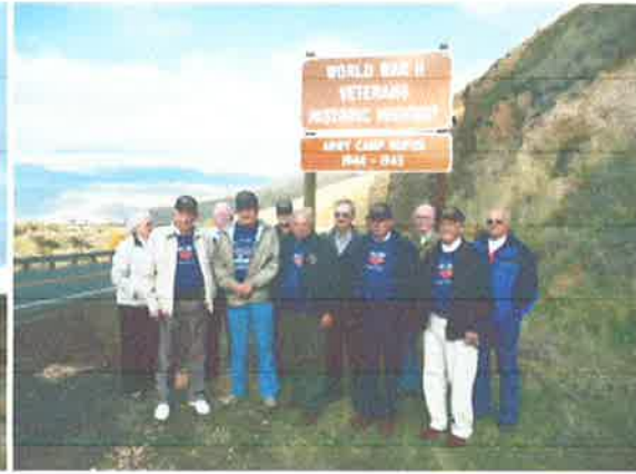
WWII Veterans Historic Highway sign on US Hwy 97 at intersection of Interstate 84