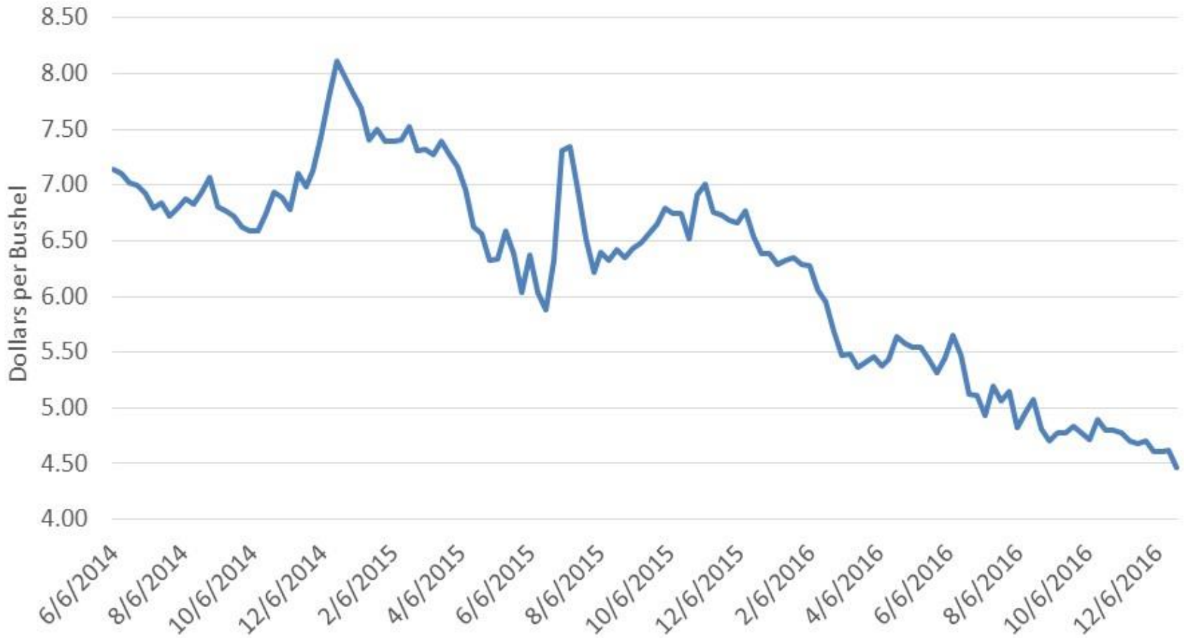
Portland Track Price SW 10.5