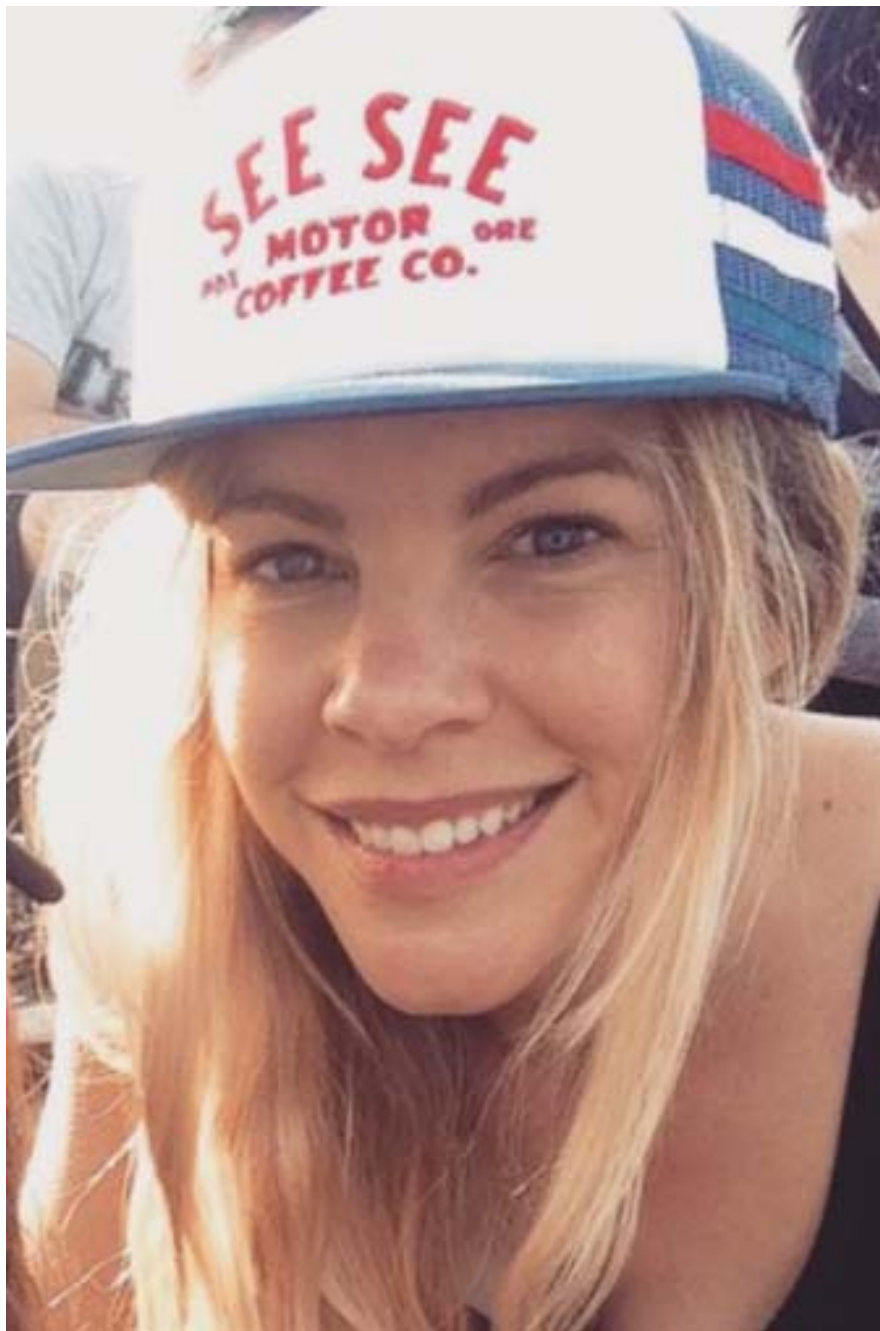
Pre vs. Post- Trauma