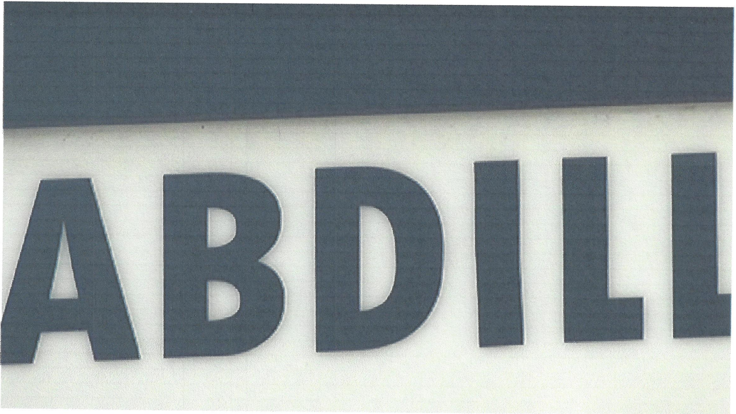
Higher Education Coordinating Commission's investigation isn't over yet, in Medford, Oregon, March 18th.