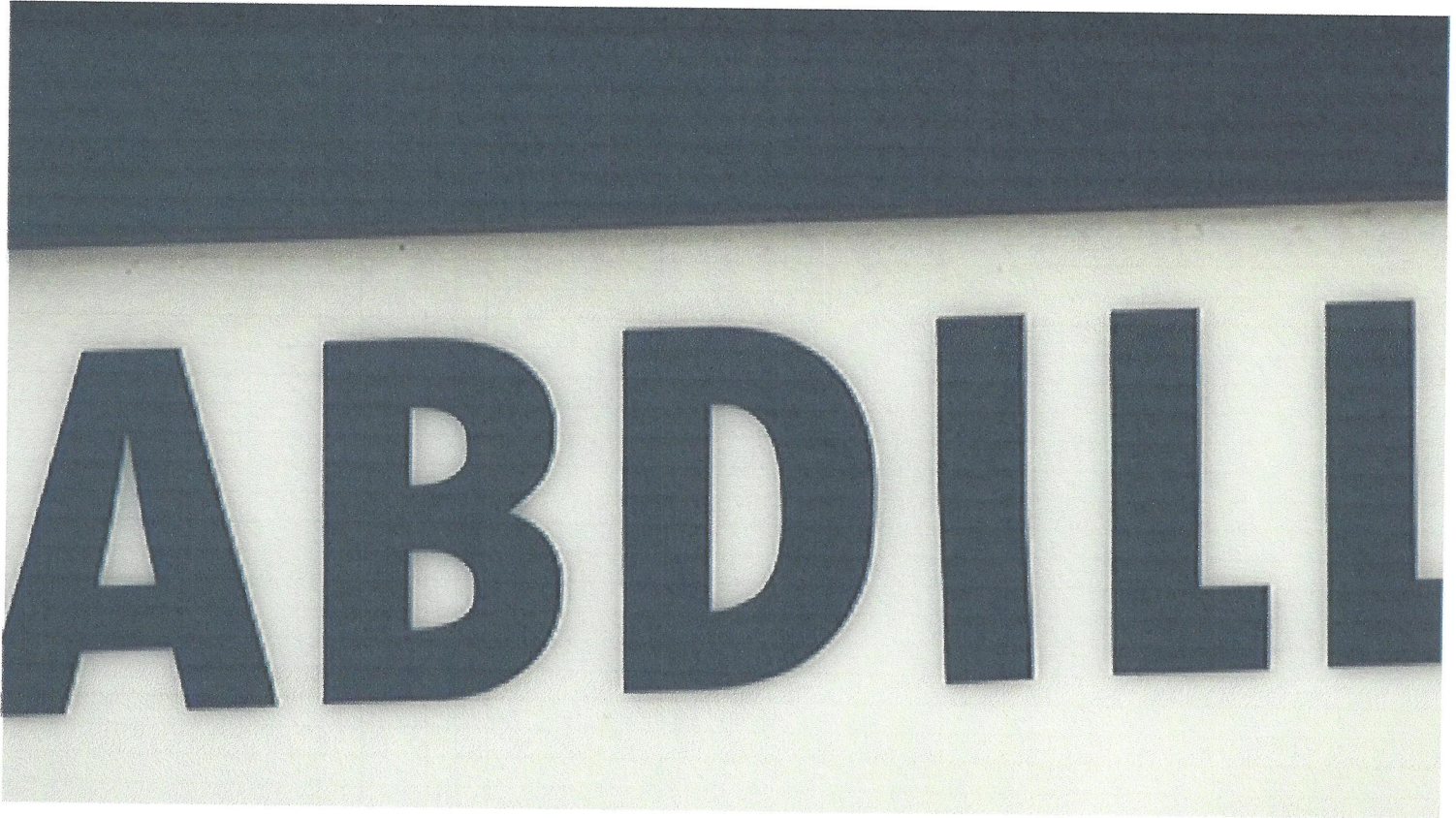
The Higher Education Coordinating Commission is almost finished with its investigation on a Medford career college.