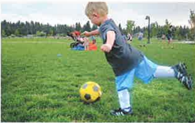
Pine Nursery Park Phase 2