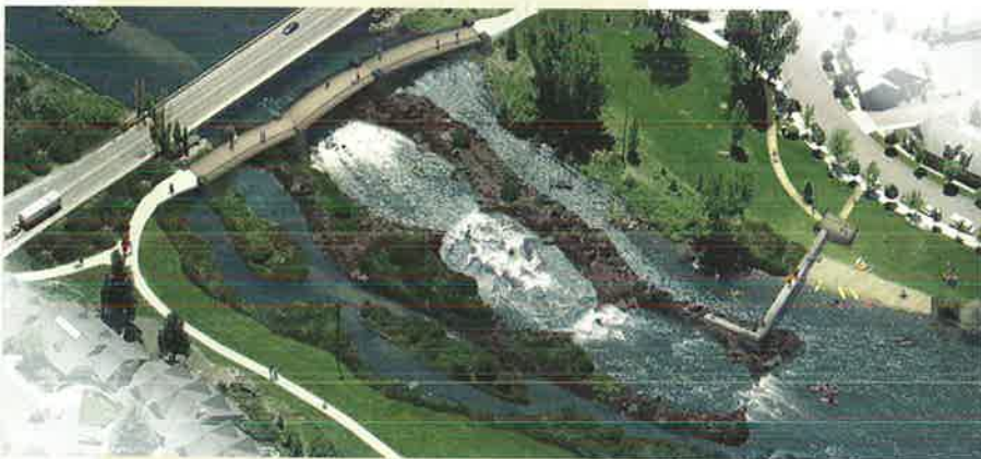
Colorado Dam improvements (artist's rendering)