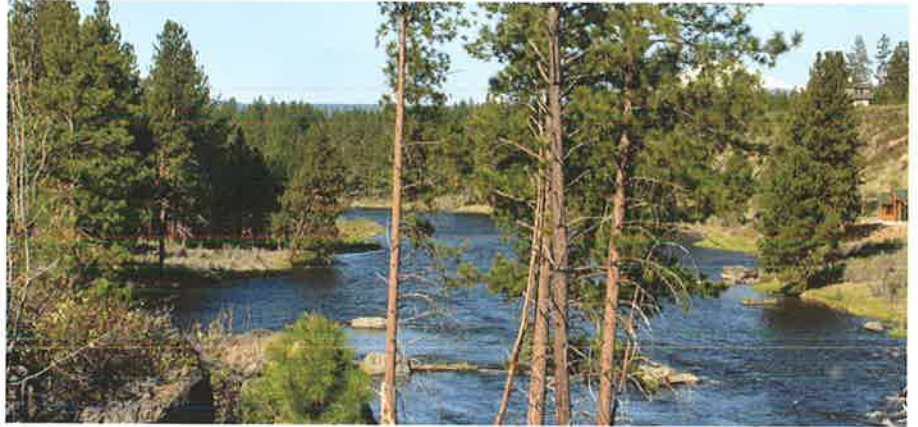
Deschutes River Trail connection to US Forest Service lands and trails to Sunriver