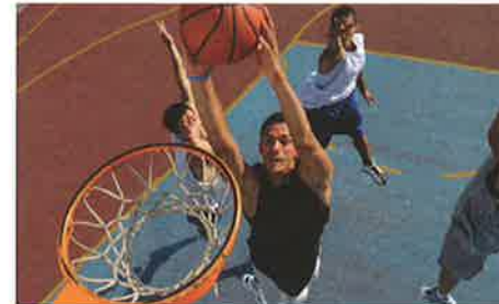
Simpson Ave. Community Recreation Center

OSU-Cascades and Bend Park & Recreation District plan to combine resources to co-develop the Simpson Ave. parkland (former Mt. Bachelor Park & Ride) to serve the needs of residents and students. Bond funded projects would provide new jobs in construction, service and recreation industries.