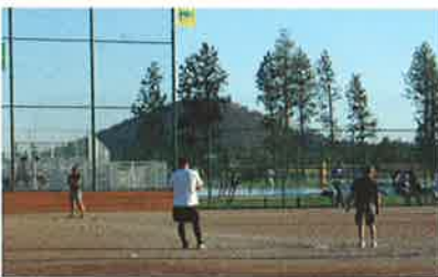
Southeast Bend Community Parks

Additional recreation facility and field development funding by Bend Ice and Bend-based Oregon Rush Soccer Club.