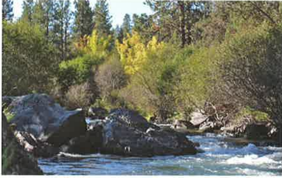
Deschutes River Trail connection to Tumalo State Park