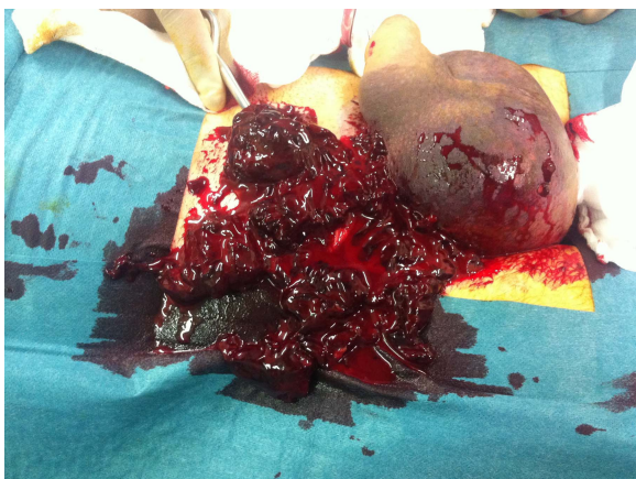
Figure 2 Intraoperative image of scrotal evacuation, showing haematoma with clots.

Interruption of this channel should ensure aspermatozoic ejaculations.