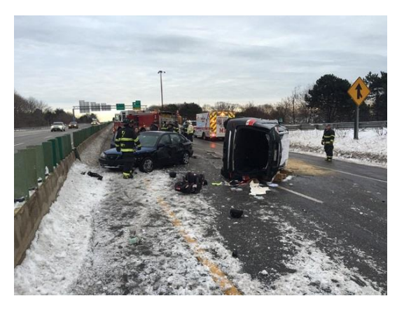
The crash scene.

How did this potentially tragic crash become a good news story? Just four weeks earlier, the family attended a Safe Kids Maine car seat inspection stations. The car seat was recalled because of a defect in the buckle; specifically it would get stuck after food and drinks leaked onto it. The