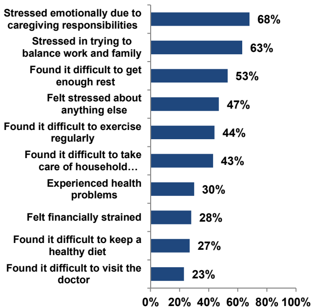
Experiences of Oregon Caregivers Age 45-Plus* (n=556 current or former Caregivers)