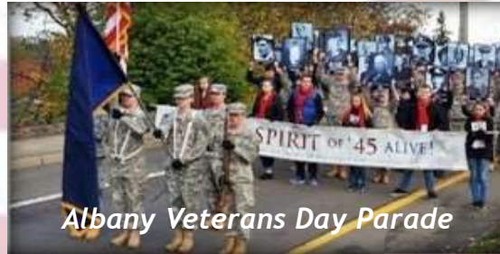
Albany Veterans Day Parade