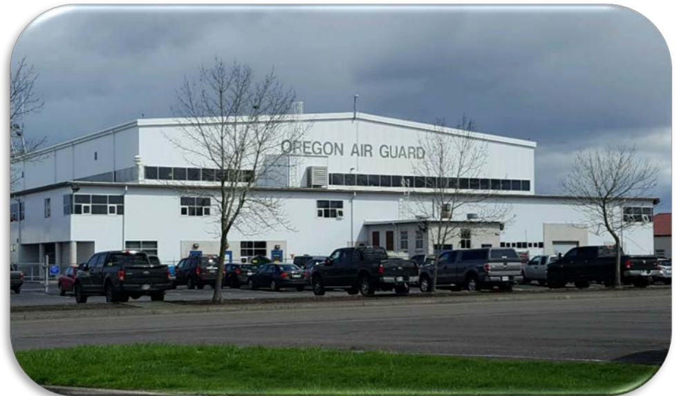
Aircraft maintenance hangar