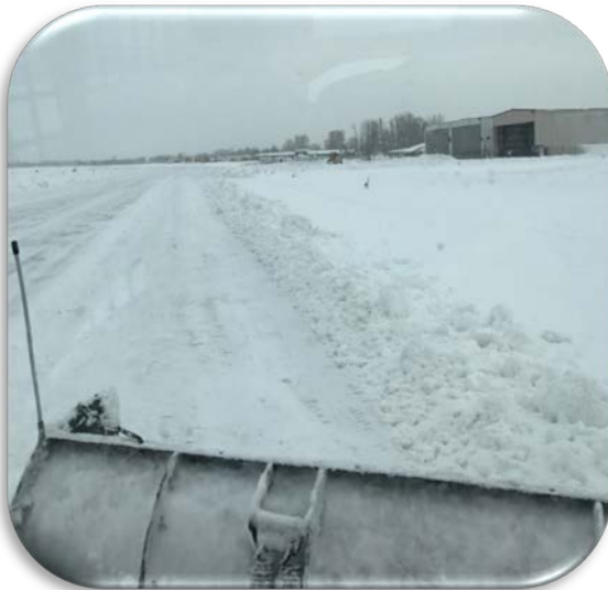
Clearing snow for jets