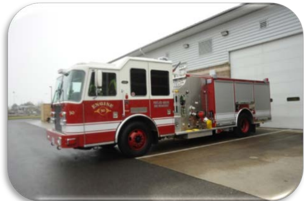
Portland Air National Guard Base