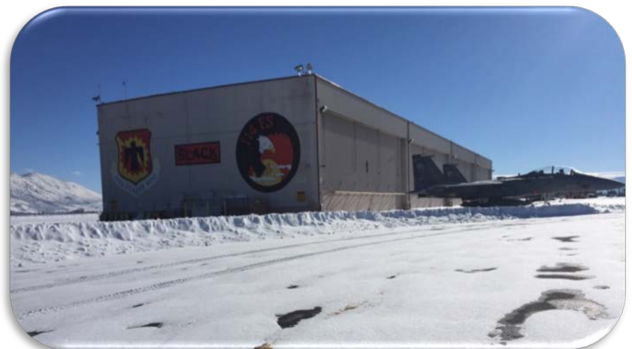
Klamath Falls Airport, Winter 2016-17