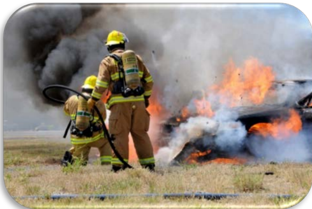
Kingsley Field, Klamath Falls