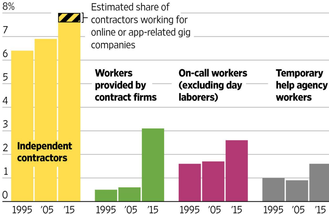
Share of workers in each type of alternate work arrangement

Sources: Labor Dept. (1995, 2005); Alan Krueger of Princeton U. and Lawrence Katz of Harvard U. (2015)