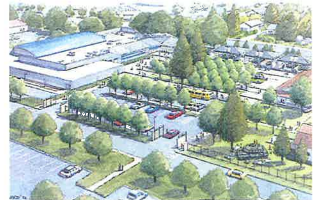
Oregon Military Museum Design Concept

-Theodore Kulongoski, Governor of Oregon (2003-2011)